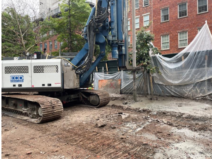
Photo 1: ECD advancing a soil mix column in the southwest part of the site (facing southeast)