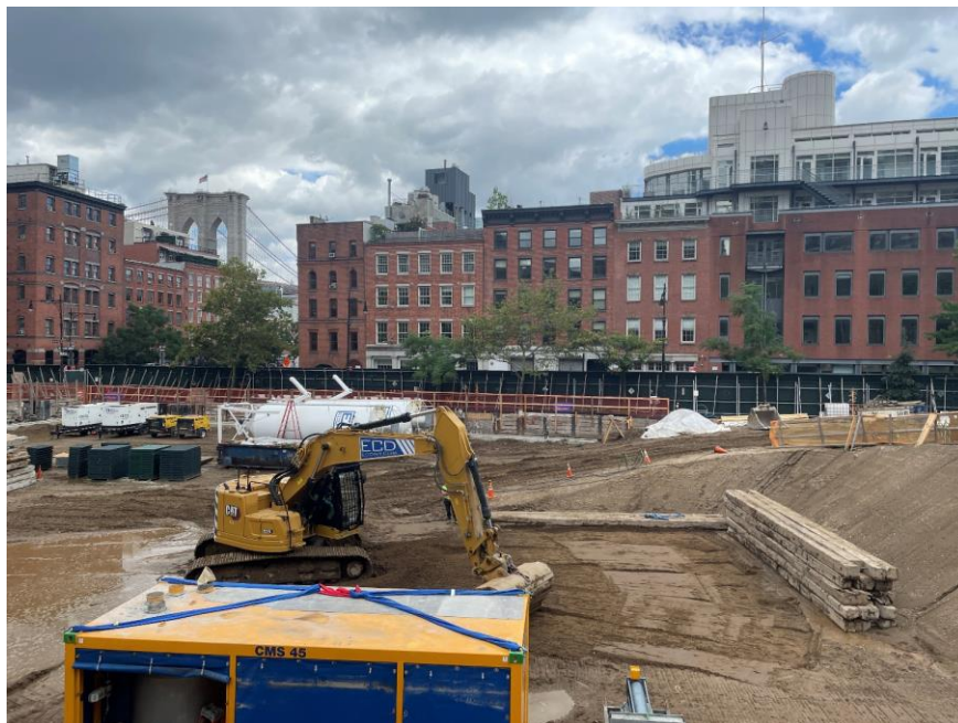
Photo 2: ECD grading soil/fill in the central part of the site (facing south)