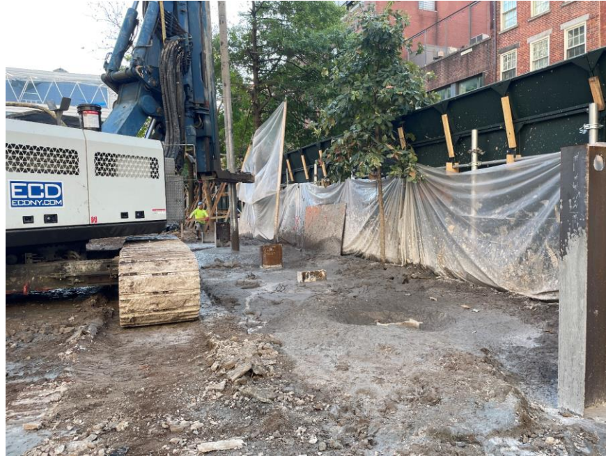
Photo 1: ECD advancing a soil mix column in the southwest part of the site (facing southeast)