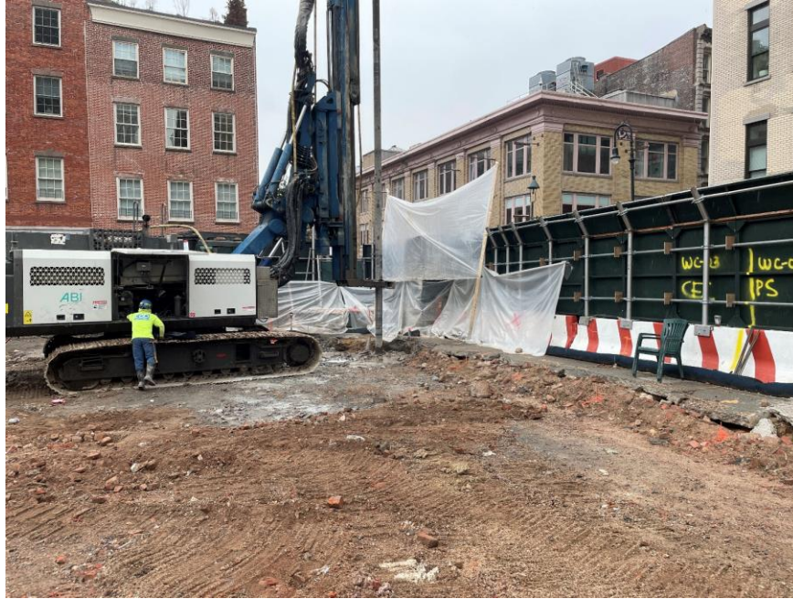
Photo 1: ECD installing a soldier pile in the southwest part of the site (facing southwest)