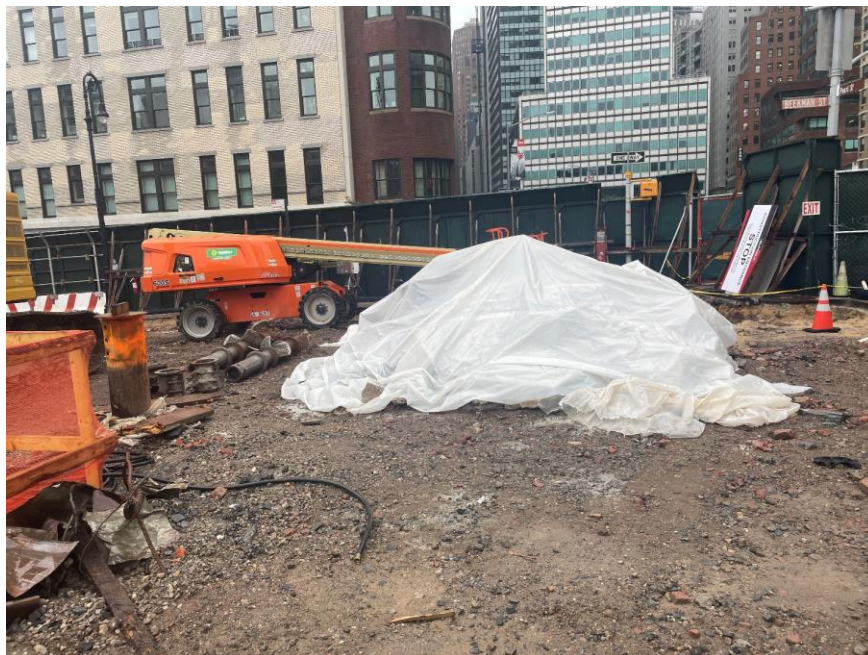
Photo 2: C&D stockpile on and covered with polyethylene sheeting in the northwestern part of the site (facing west)