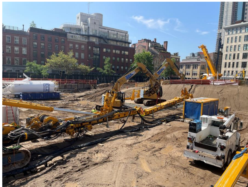
Photo 2: ECD mobilizing a Bauer BG45 drill rig in the eastern part of the site (facing southwest)