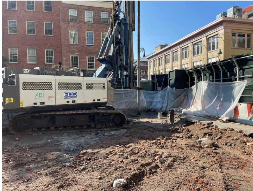
Photo 1: ECD installing a soldier pile in the southwest part of the site (facing southwest)