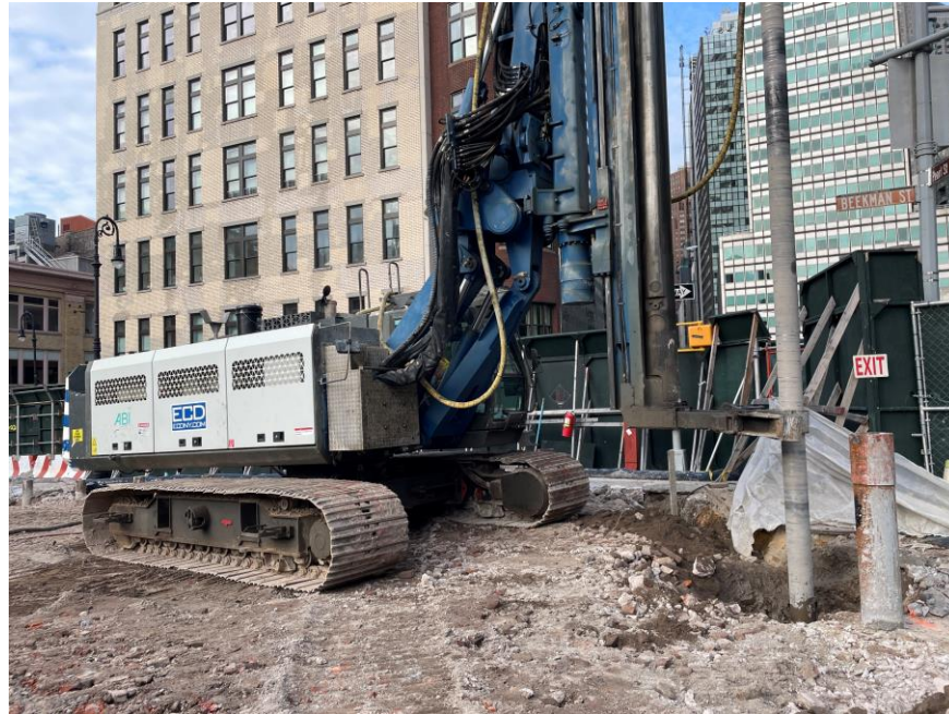
Photo 1: ECD installing a soldier pile in the northwestern part of the site (facing west)