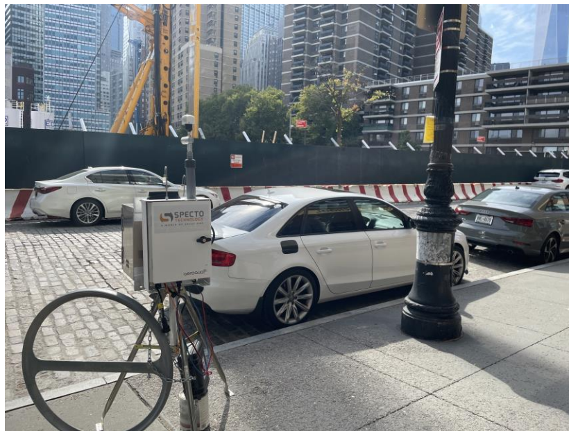
Photo 2: CAMP station WZ-3 on the eastern sidewalk of Peck Slip (facing northwest)