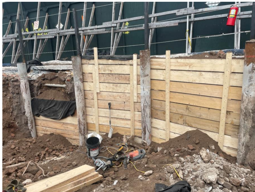
Photo 2: Timber lagging installed along the western perimeter of the site (facing west)