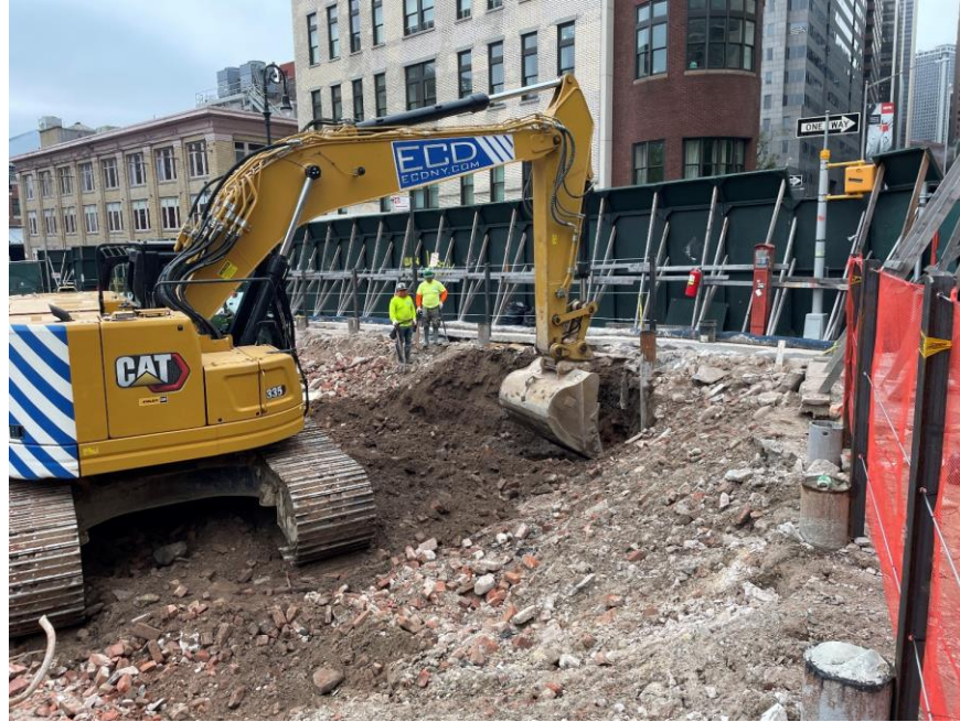
Photo 1: ECD excavating soil/fill in the western part of the site (facing southwest)