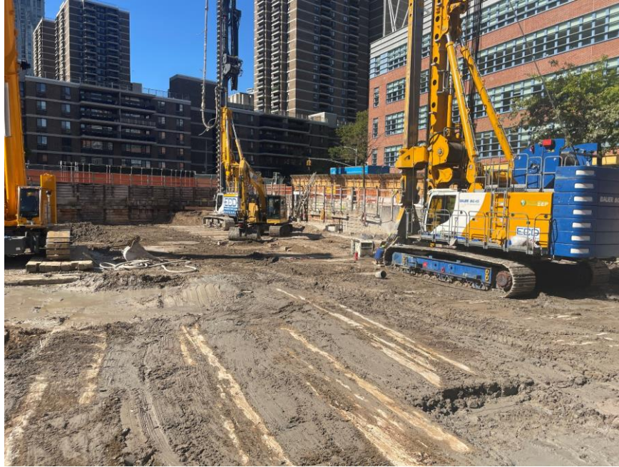
Photo 1: General view of the eastern part of the site (facing northeast)