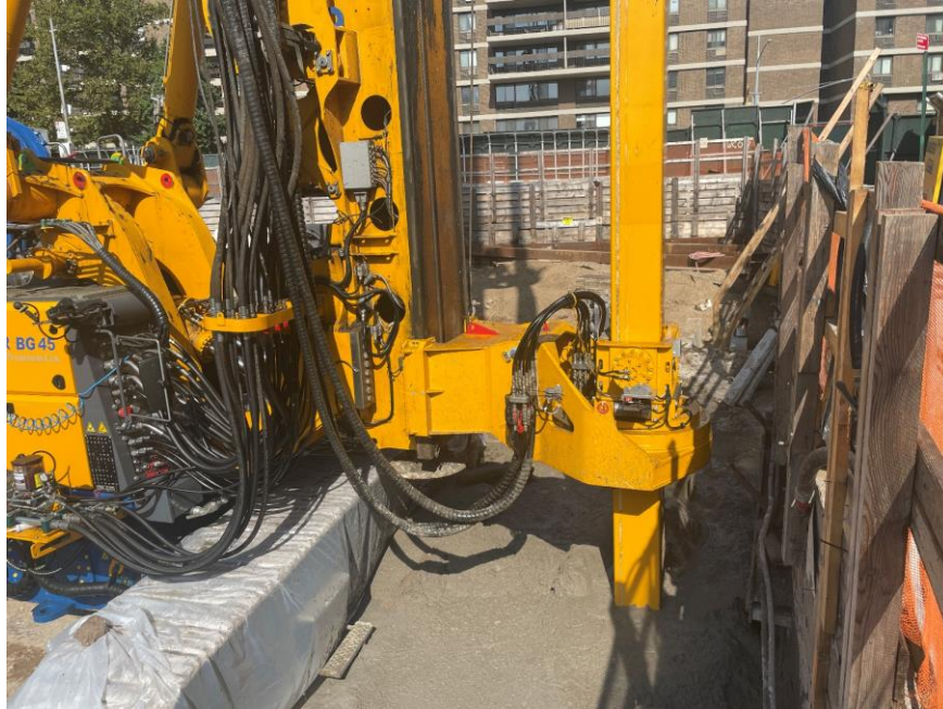
Photo 1: ECD installing a soil mix column in the eastern part of the site (facing north)