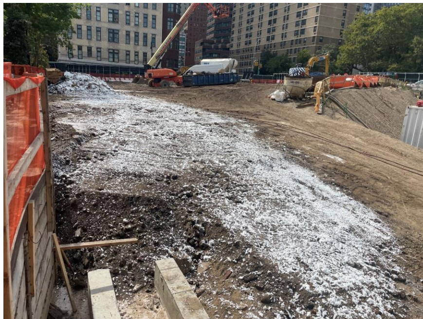
Photo 2: Atmos® AC-645 odor/vapor suppressing foam applied to soil/fill in the southern part of the site (facing northwest)