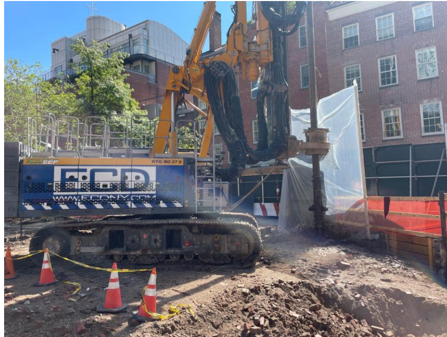
Photo 1: ECD advancing a soil mix column in the southwest part of the site (facing south)