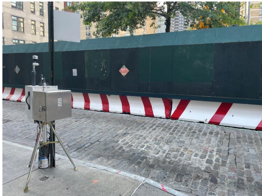
Photo 2: CAMP station WZ-2 on the southern sidewalk of Water Street (facing northwest)