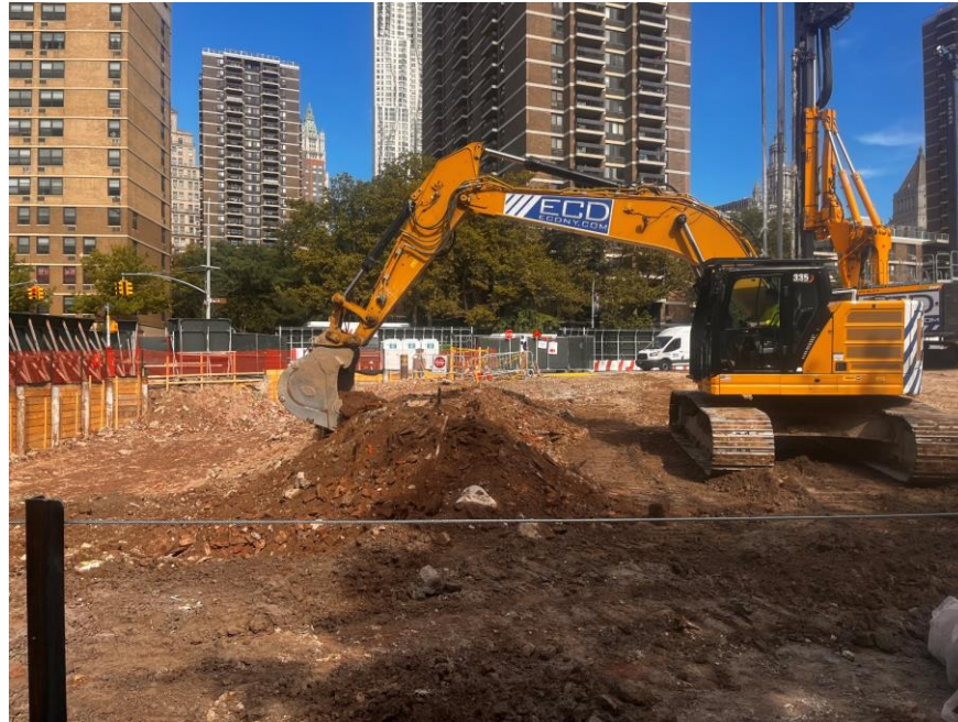
Photo 1: ECD excavating soil/fill in the western part of the site (facing north)