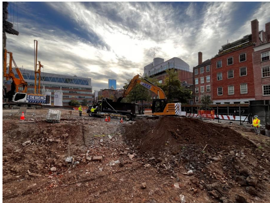
Photo 2: ECD loading a tri-axle dump truck with soil/fill in the southwest part of the site (facing east)