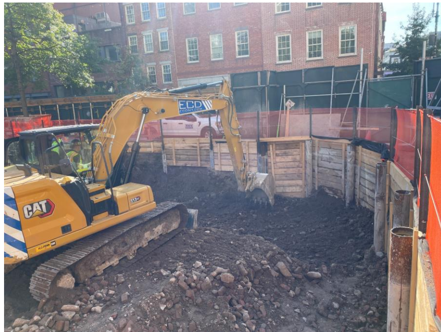
Photo 2: ECD excavating soil/fill in the southwest part of the site (facing south)