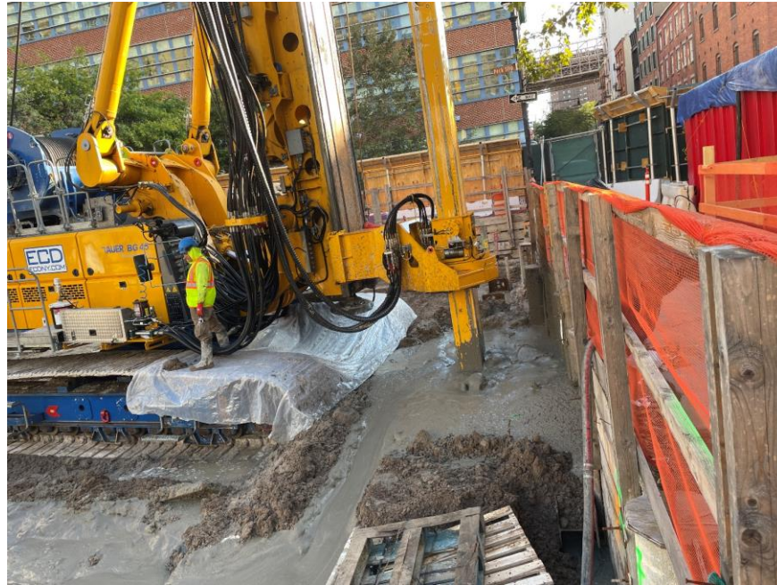
Photo 1: ECD attempting to install a soil mix column in the southeast part of the site (facing east)