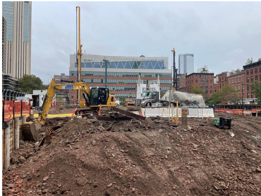
Photo 2: ECD excavating soil/fill in the northern part of the site (facing east)