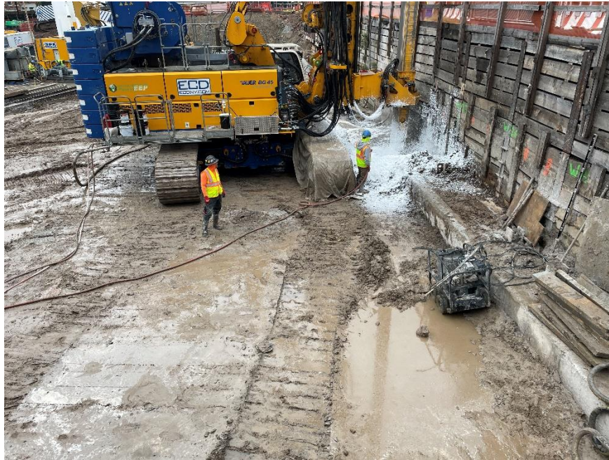
Photo 1 Atmos® AC-645 odor/vapor suppressing foam proactively applied to soil/fill in the northern part of the site (facing west)