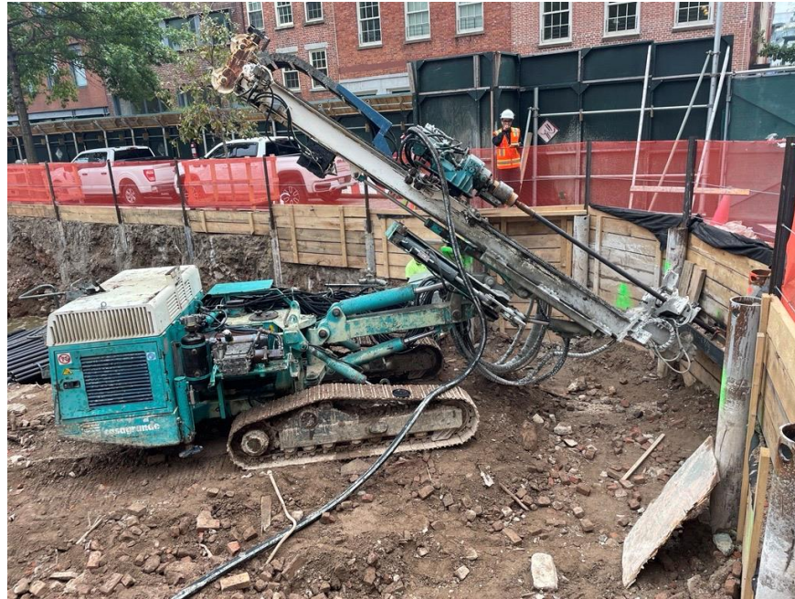
Photo 1: ECD installing a tieback along the western perimeter of the site (facing south)