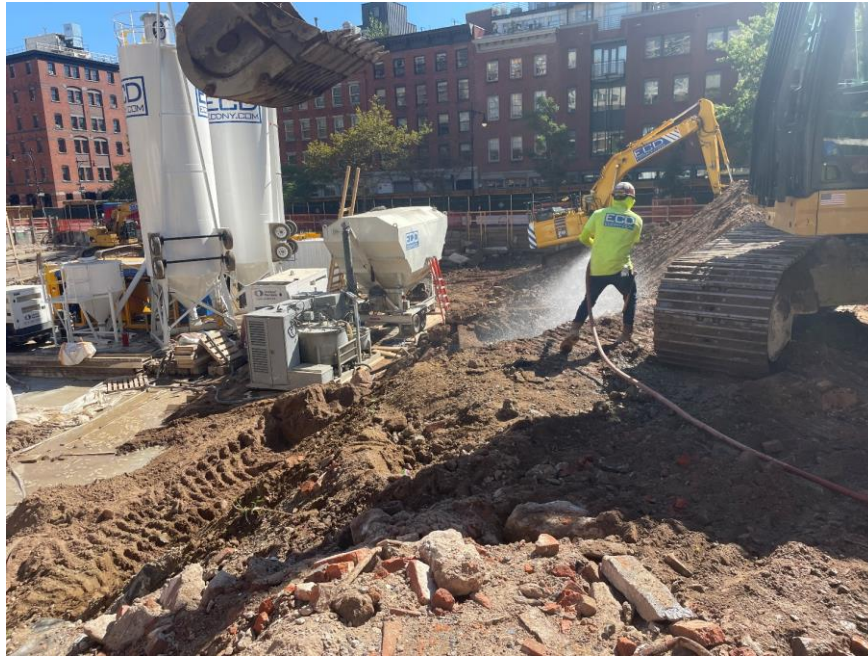
Photo 1: Mercon-X ® mercury vapor suppressant proactively applied to soil/fill during excavation (facing south)