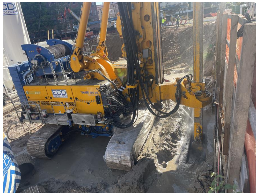
Photo 2: ECD installing a soil mix column in the northern part of the site (facing west)