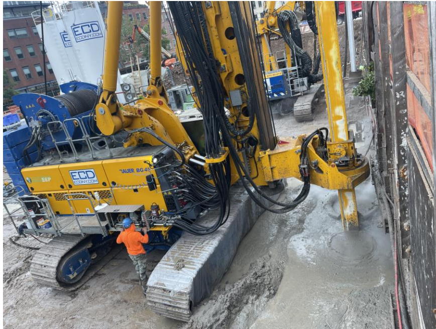
Photo 1: ECD installing a soil mix column in the northern part of the site (facing west)