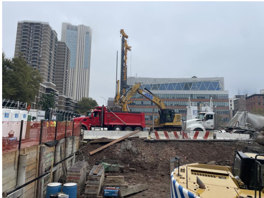
Photo 2: ECD loading a truck with soil/fill for off-site disposal (facing northeast)