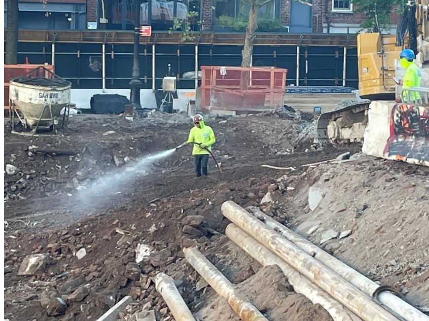
Photo 1: Mercon-X ® mercury vapor suppressant proactively applied to soil/fill during excavation (facing south)