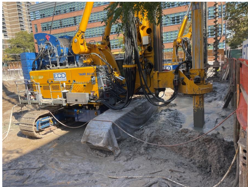
Photo 2: ECD installing a soil mix column in the southern part of the site (facing east)