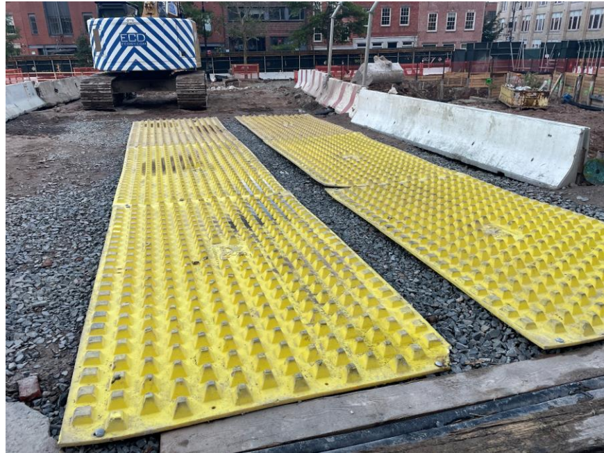
Photo 1: General view of the stabilized construction entrance (facing south)