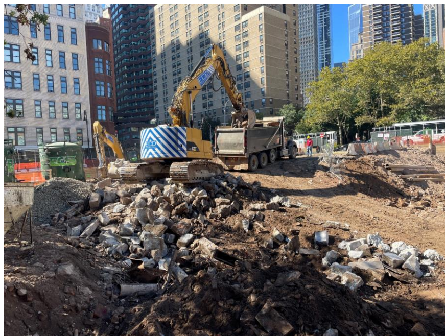
Photo 2: ECD loading a truck with C&D debris for off-site disposal (facing northwest)