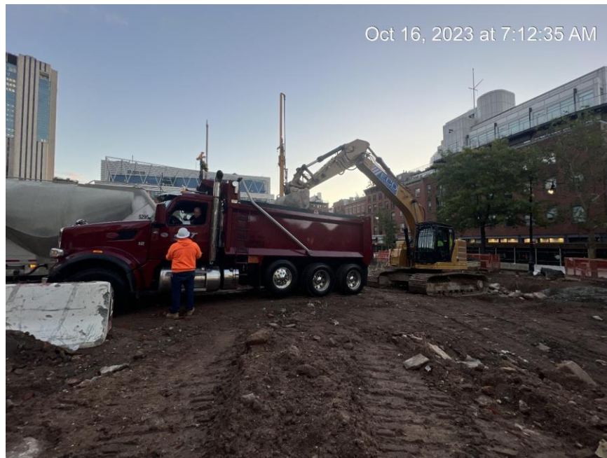
Photo 2: ECD loading a truck with C&D debris for off-site disposal (facing northeast)