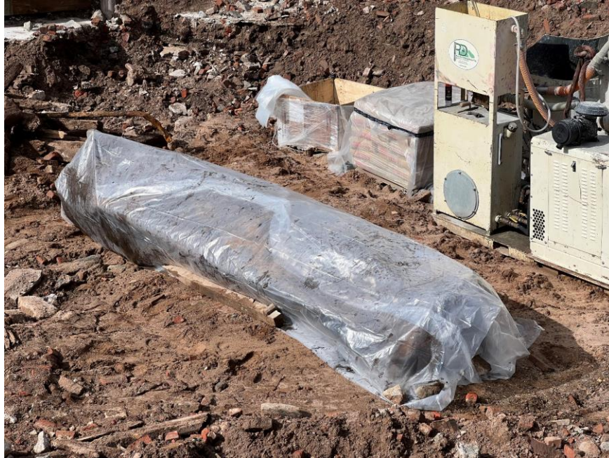
Photo 1: UST wrapped in polyethylene sheeting in preparation for decommissioning and off-site disposal