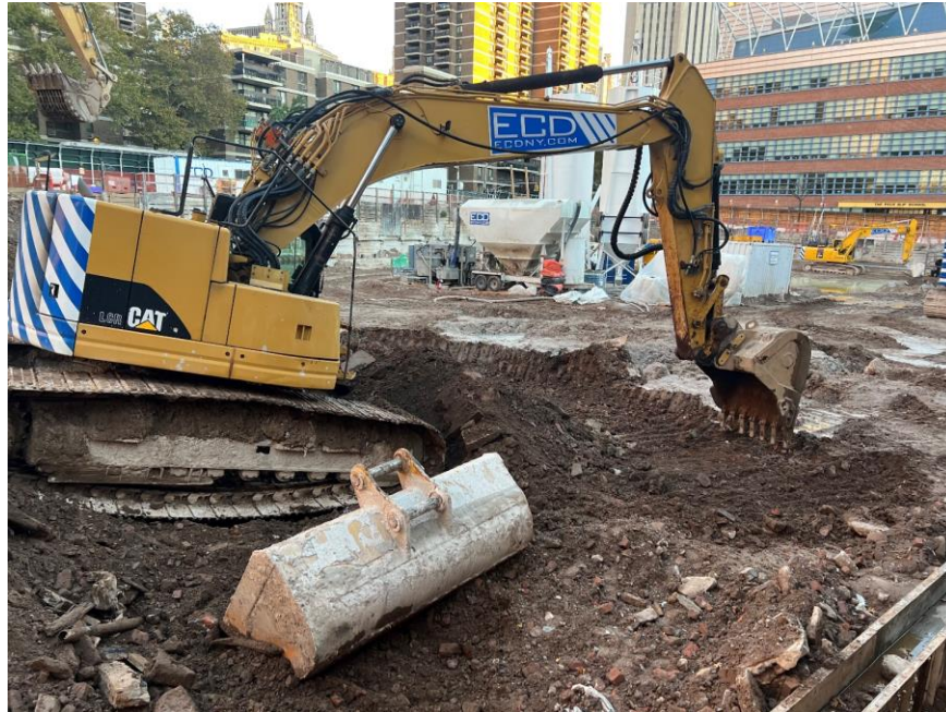
Photo 1: ECD excavating soil/fill in the western part of the site (facing east)