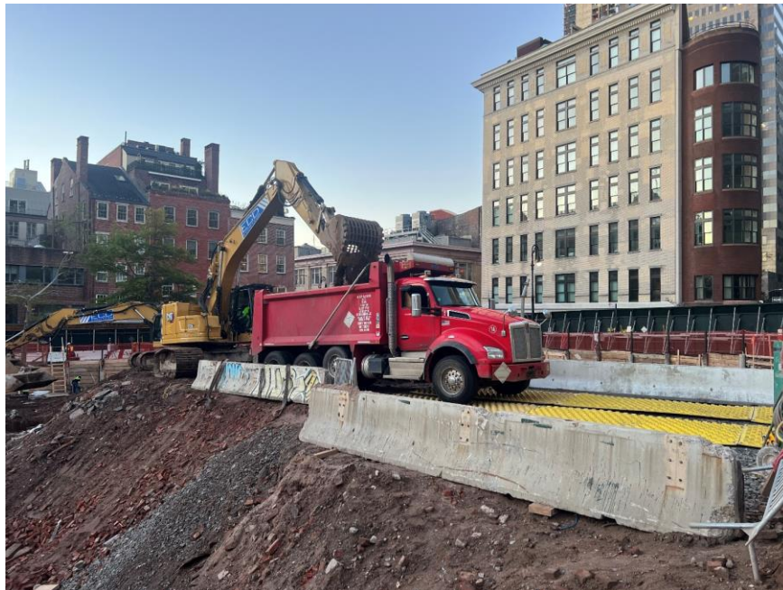
Photo 2: ECD loading a truck with soil/fill for off-site disposal (facing southeast)