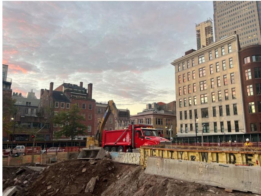
Photo 2: ECD loading a truck with soil/fill for off-site disposal (facing southwest)