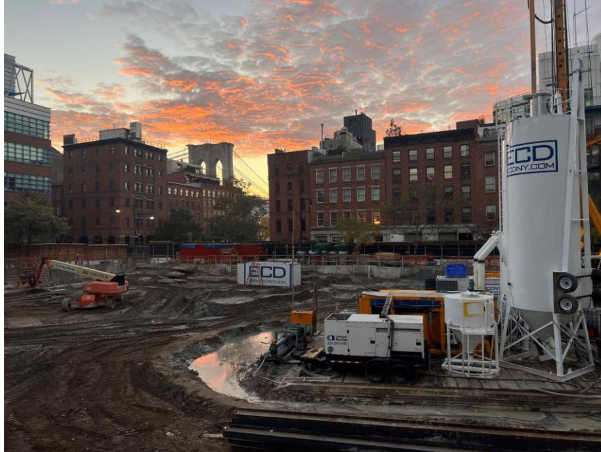
Photo 1: General view of the eastern part of site (facing southeast)