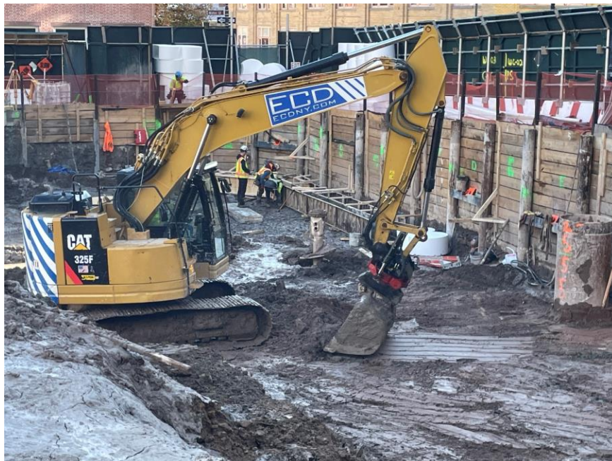
Photo 2: ECD grading soil/fill in the northwest part of site (facing southwest)