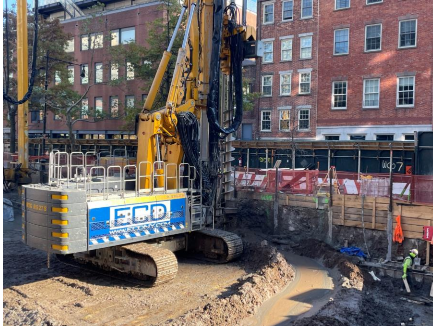
Photo 1: ECD pre-drilling a borehole for soil mix column installation along the southern site boundary (facing south)