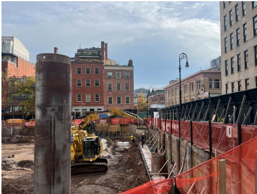
Photo 2: ECD pouring concrete for the guide wall in the western part of the site (facing south)