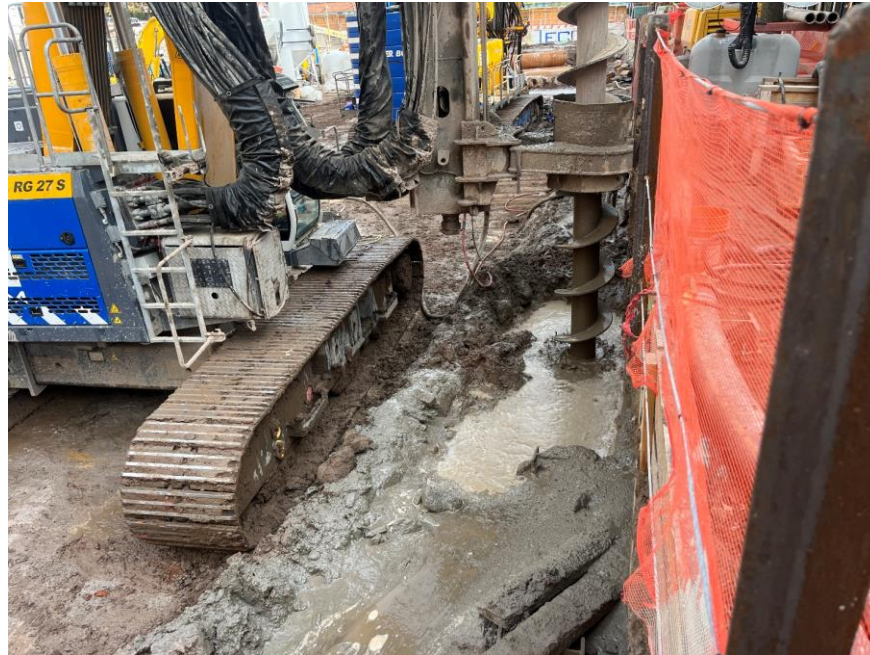
Photo 1: ECD pre-drilling a borehole for soil mix column installation in the southern part of the site (facing east)