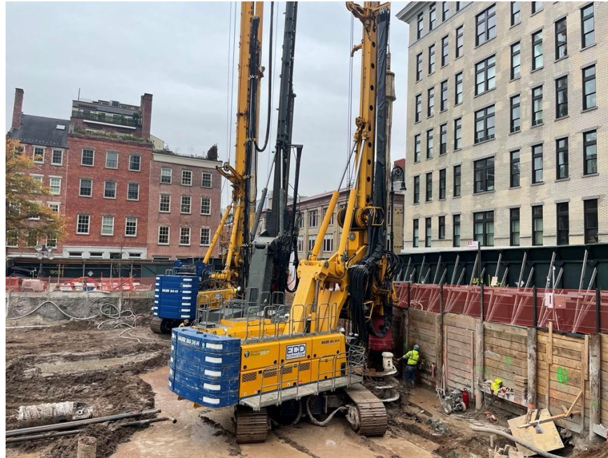
Photo 1: ECD installing a secant pile in western part of the site (facing southwest)