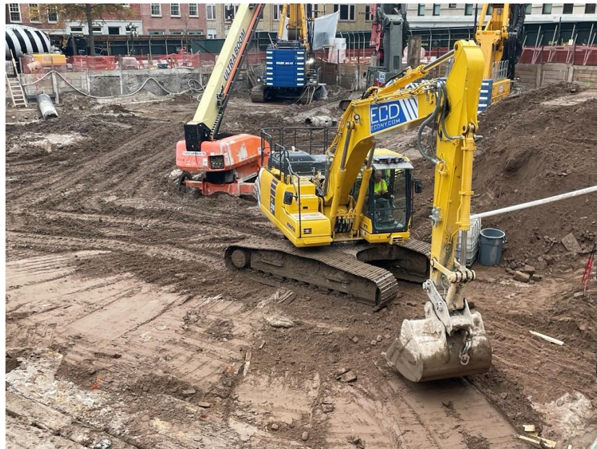
Photo 2: ECD grading soil/fill in northern part of site (facing southwest)