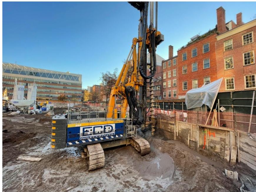
Photo 2: ECD pre-drilling a soil mix column in southwestern part of site (facing east)