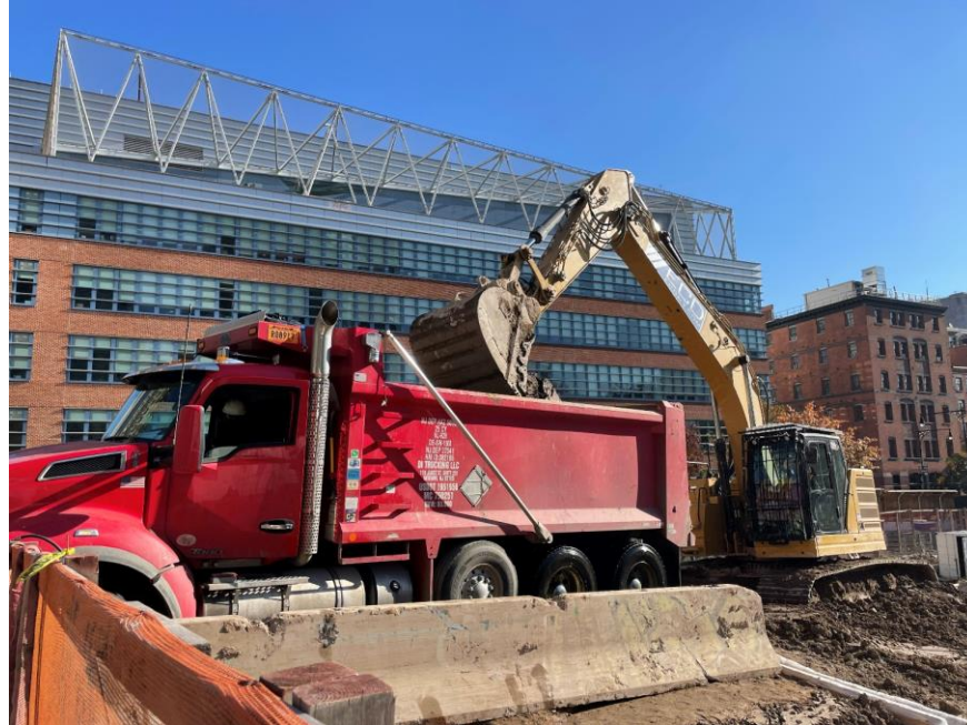
Photo 1: ECD loading a truck with non-hazardous soil/fill for off-site disposal (facing southeast)