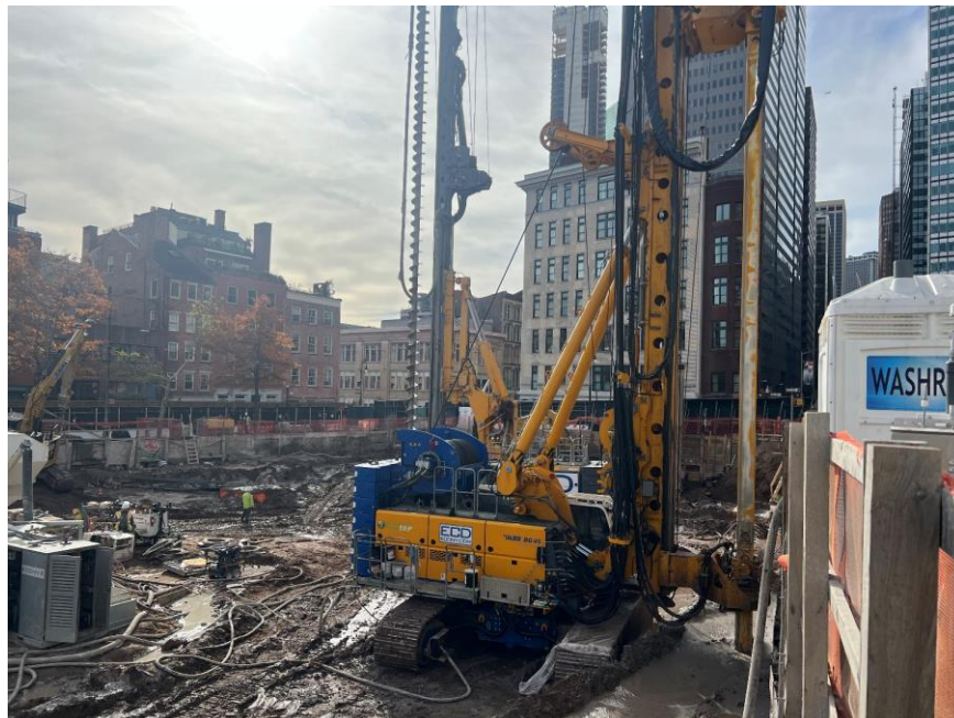
Photo 2: ECD installing a soil mix column in the northern part of site (facing southwest)