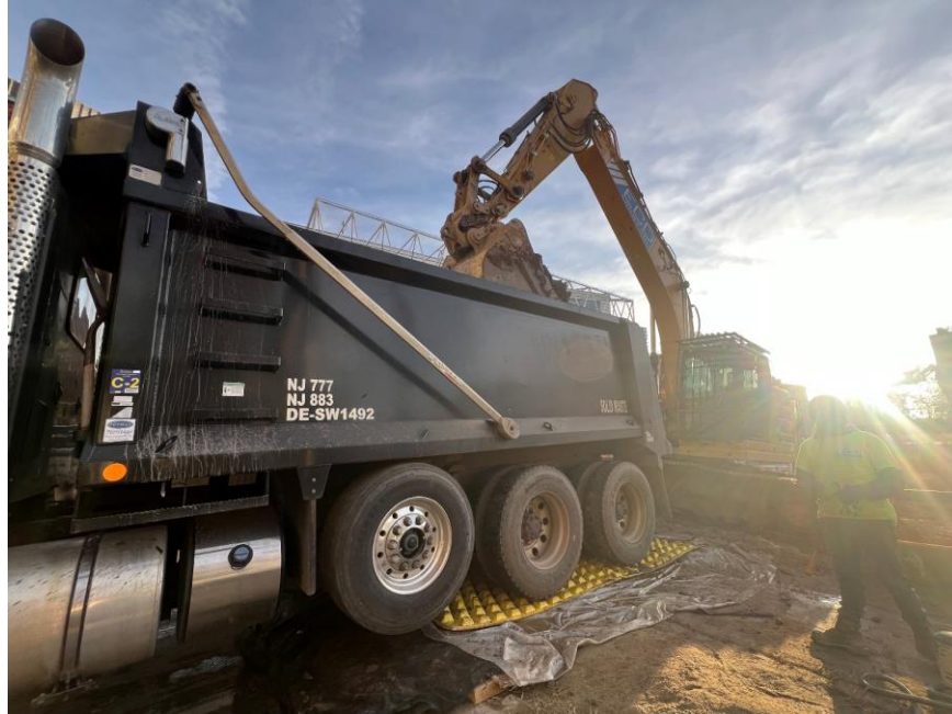
Photo 1: ECD loading a truck with non-hazardous soil/fill for off-site disposal (facing south)