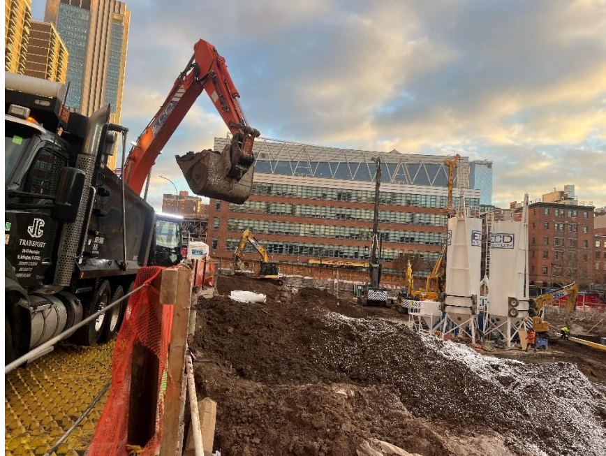
Photo 1: ECD loading a truck with soil/fill for off-site disposal (facing east)