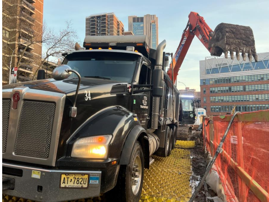
Photo 1: ECD loading a truck with soil/fill for off-site disposal (facing east)