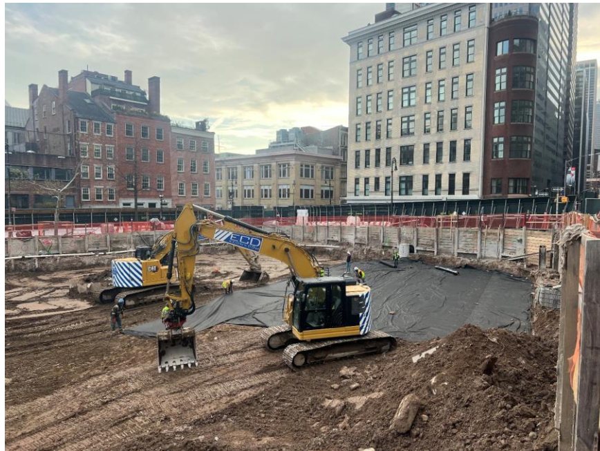
Photo 2: ECD placing geotextile fabric in the western part of site (facing southeast)