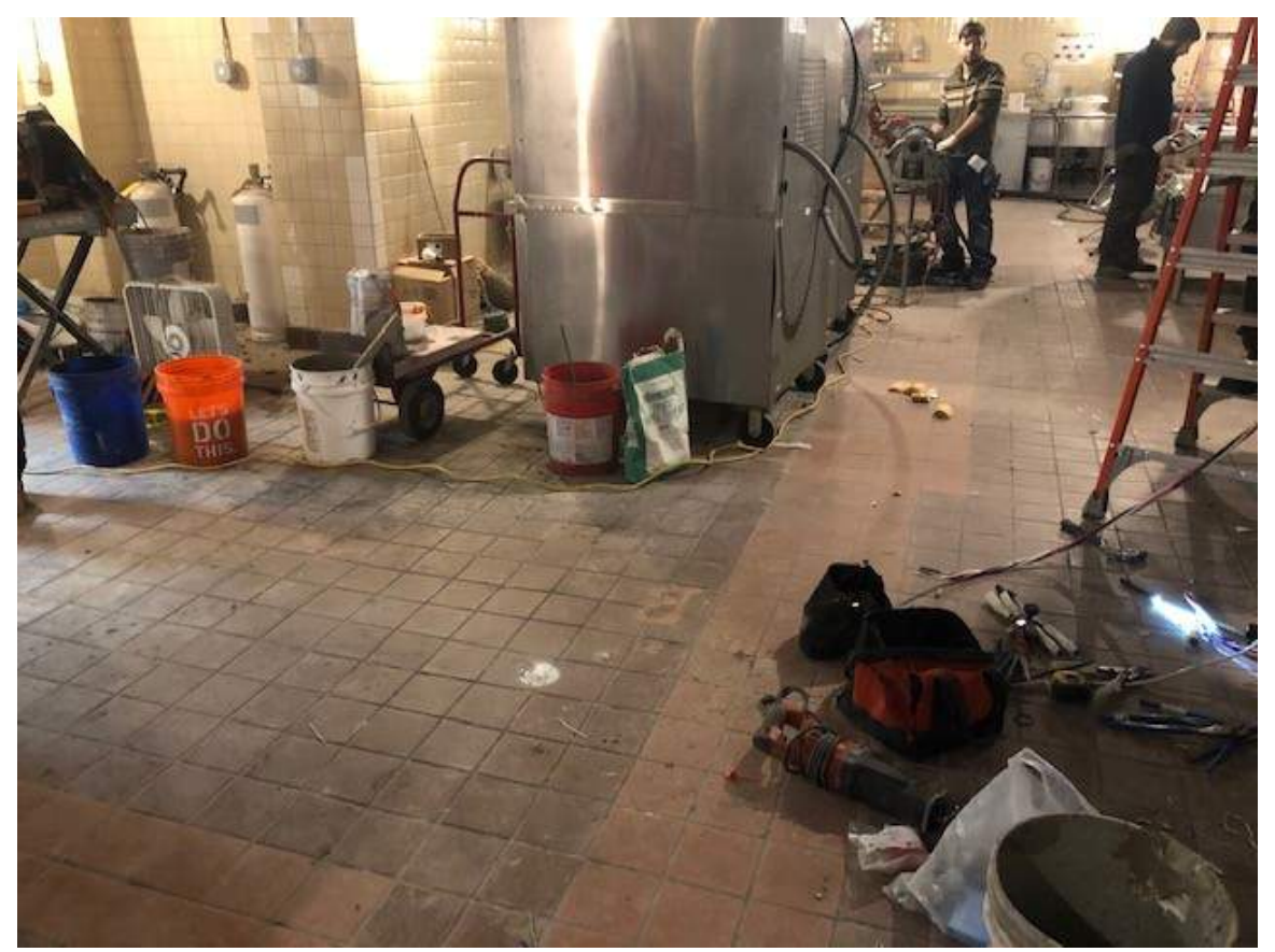
Figure 1: Proposed boring location in kitchen area.

The utility survey was conducted using a cart-mounted GPR unit and a RD unit. The RD unit was used to trace common utilities from sources in and around the survey area. The RD receiver was also used in the passive mode to search for live underground electrical power cables and other utilities emitting 60Hz electromagnetic signals. When possible, the location of utilities was confirmed with the GPR. The GPR survey was also performed in a grid pattern in at least two orthogonal directions to search for evident and non-evident underground utilities. Linear anomalies consistent with underground utilities were designated on site with spray paint using the following colors: pink – unknown utilities. (See Figures 1-6)