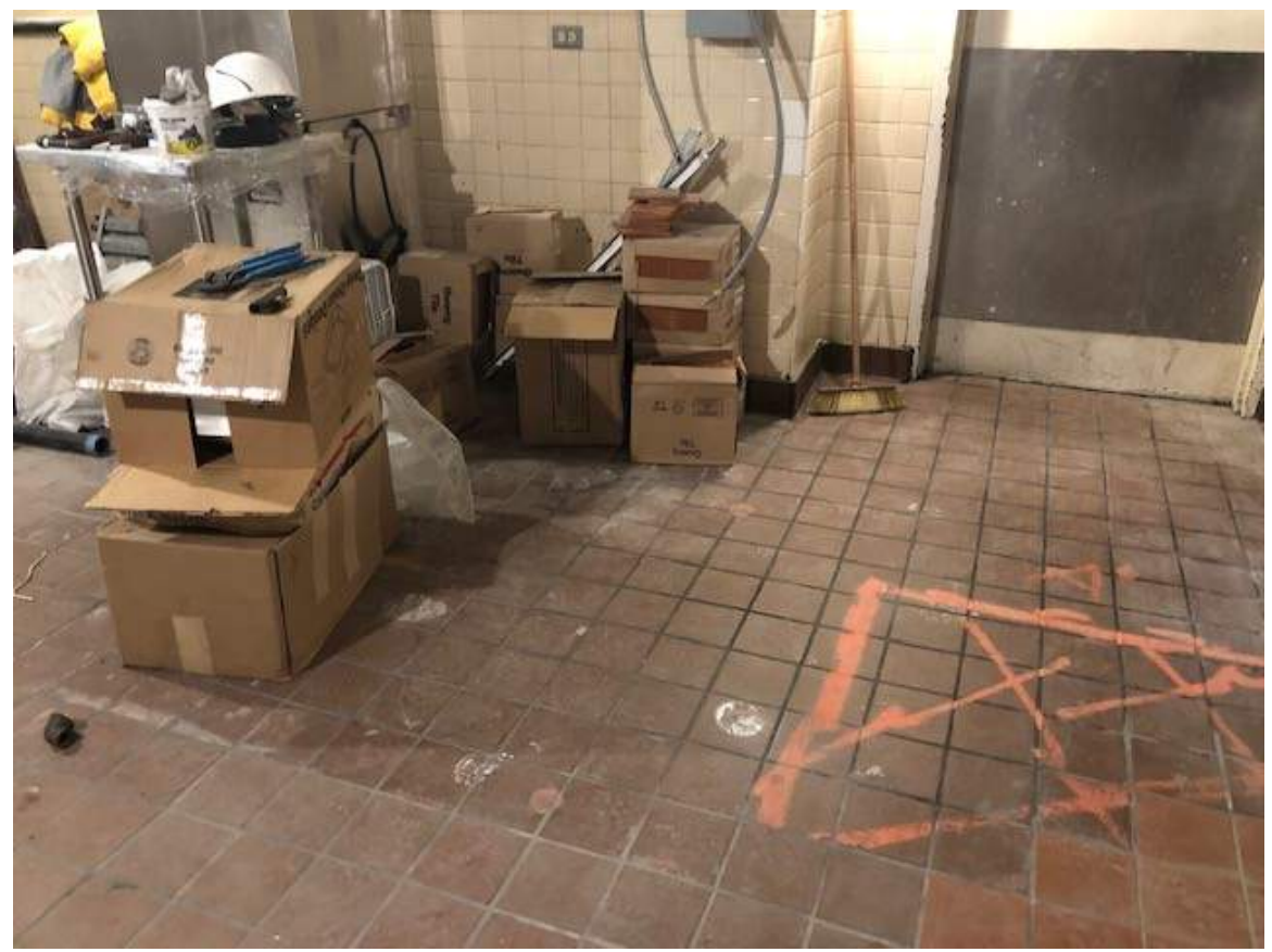
Figure 2: Proposed boring location in kitchen area.