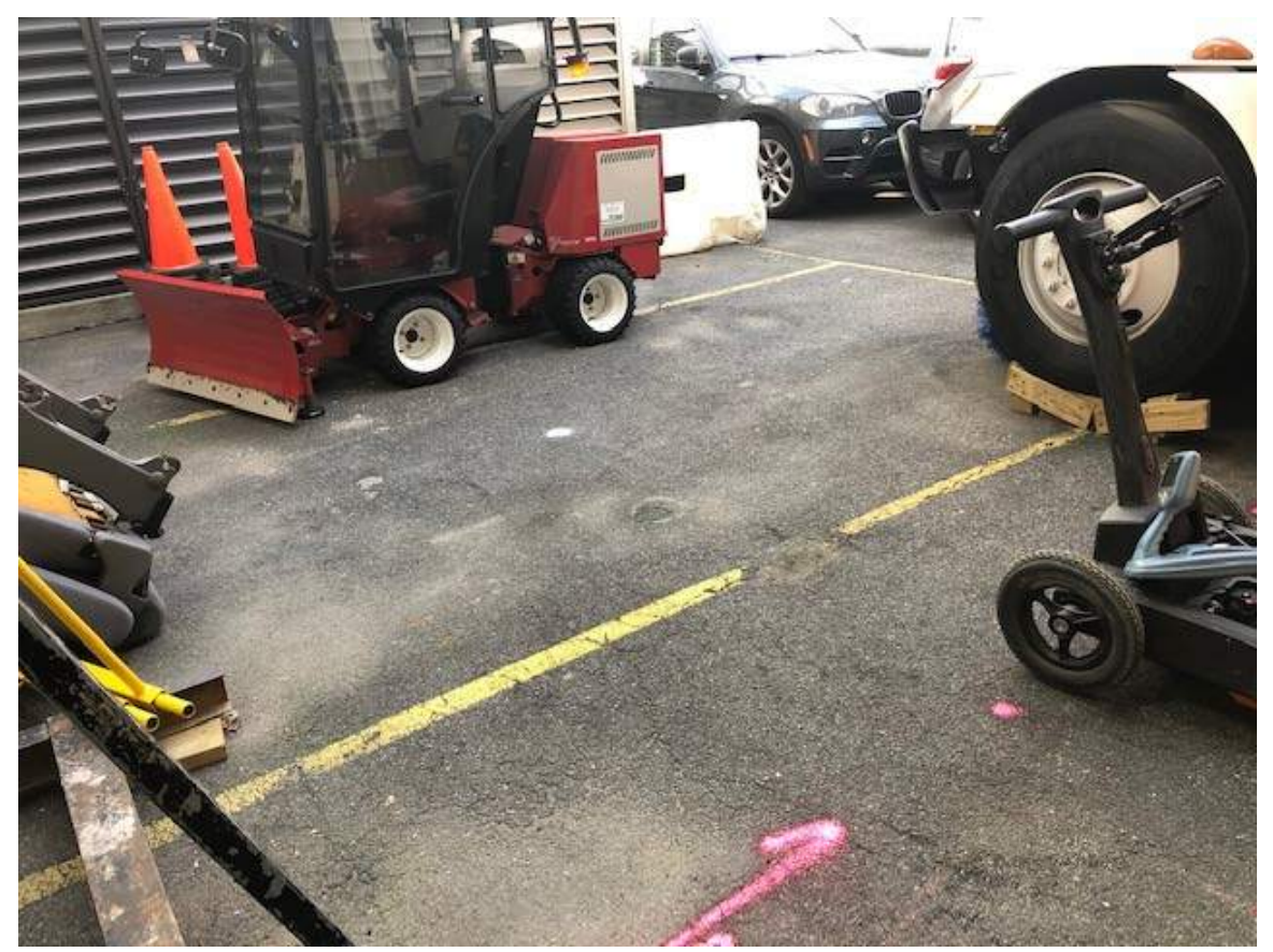
Figure 6: Proposed boring location and unknown utility in outside area.

Client-directed proposed boring locations were investigated with the GPR and RD receiver. When possible, an area of approximately 10 ft by 10 ft surrounding each location was scanned. In some cases, obstructions prevented an investigation of the entire 10 ft by 10 ft area.