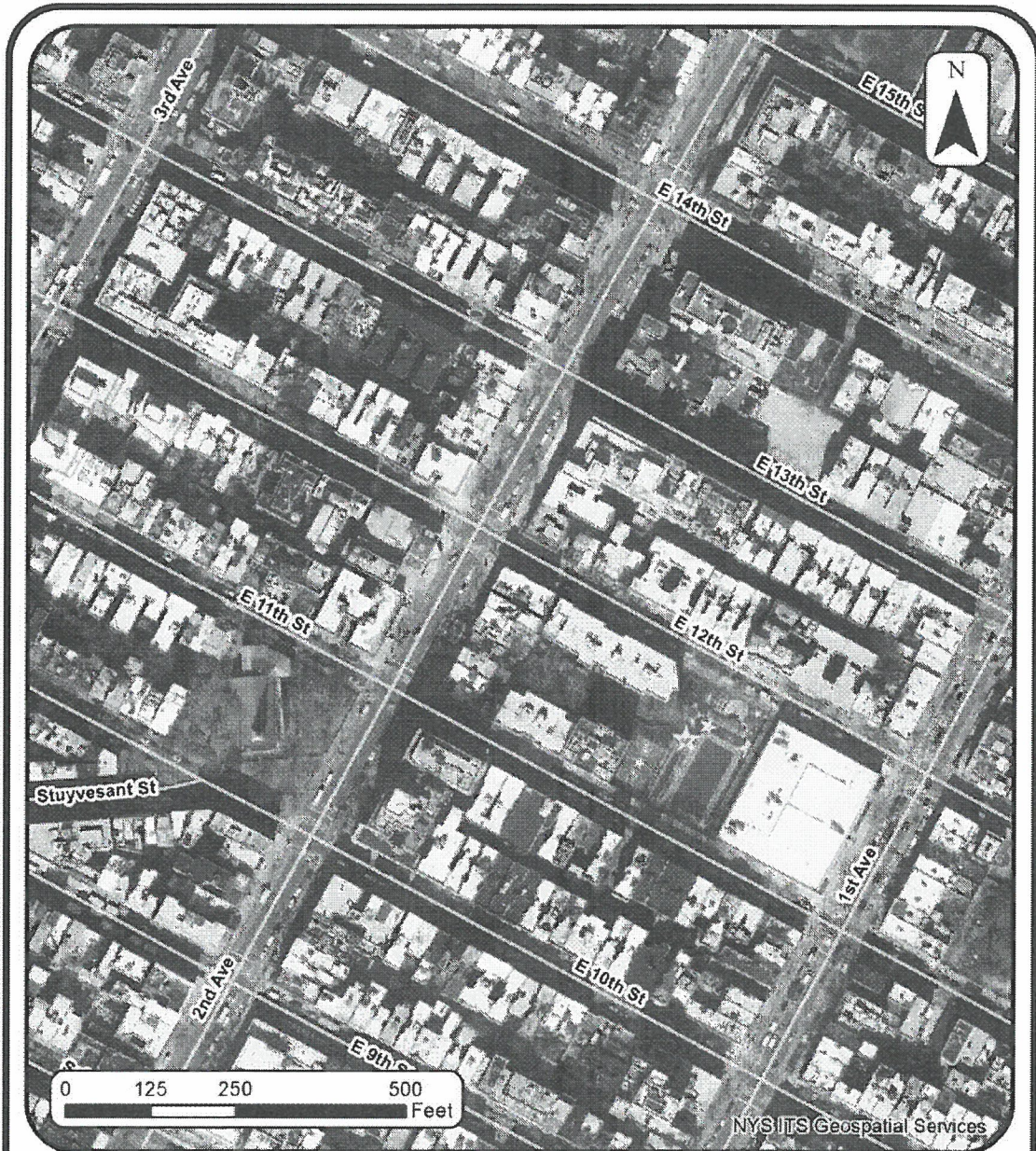
EXHIBIT A SITE MAP