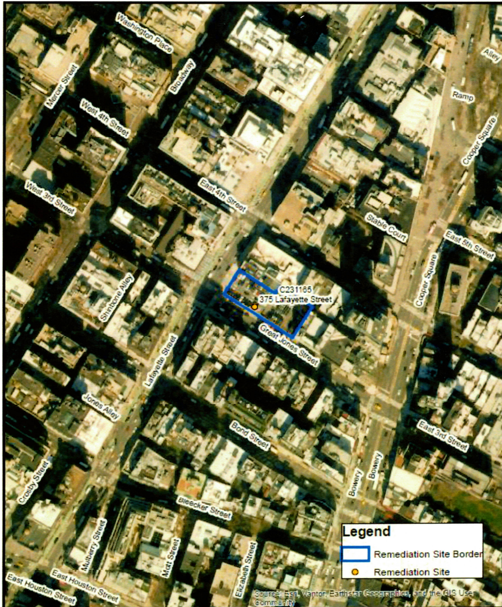
Site Map Site No. C231165 375 Lafayette Street New York, NY