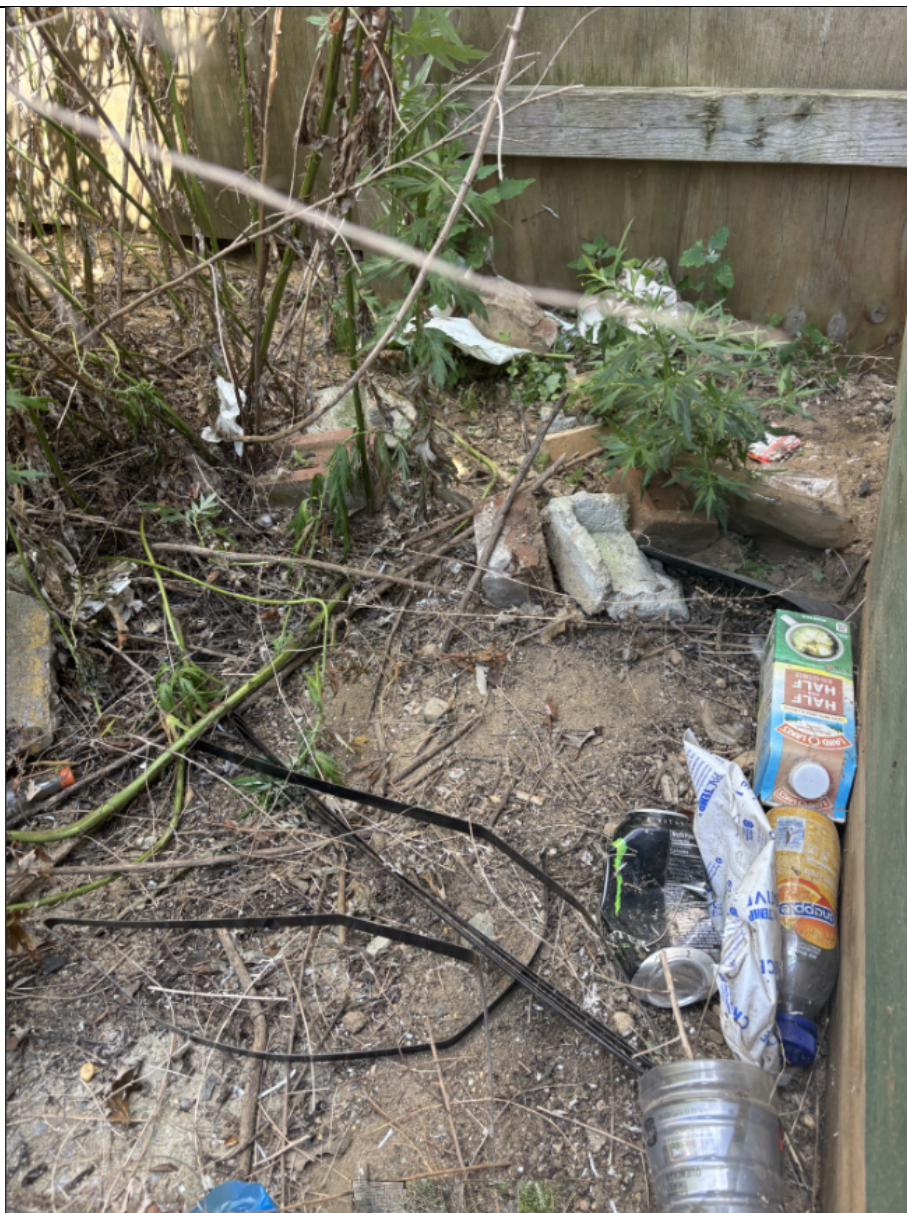
Photo 3: Sediment and debris buildup at the apparent location of MW-6 within the fenced portion of the Site