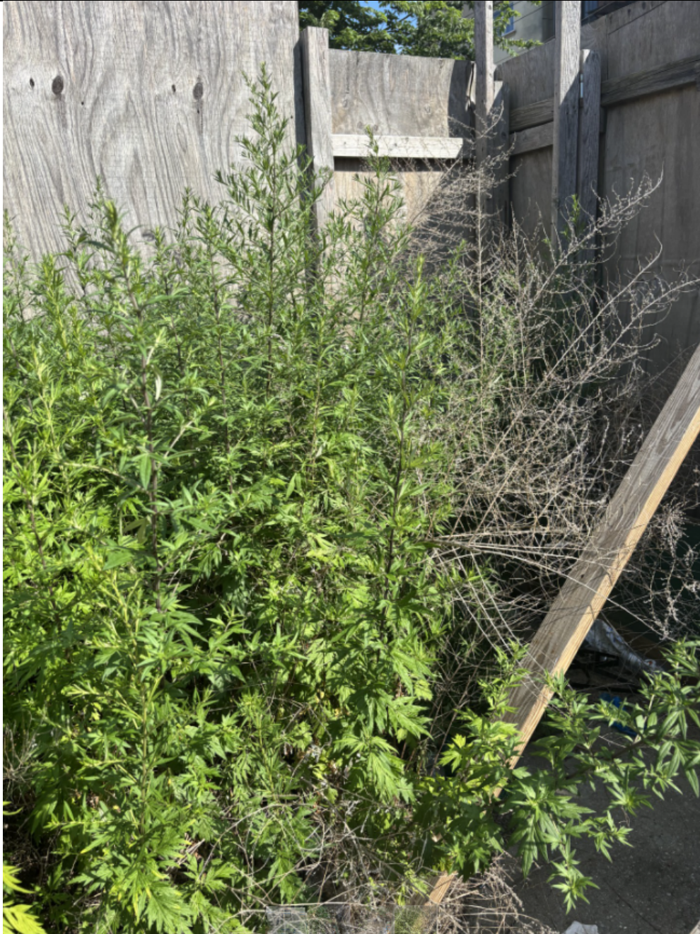
Photo 4: Vegetation overgrowth at the apparent location of MW-6 within the fenced portion of the Site boundary.