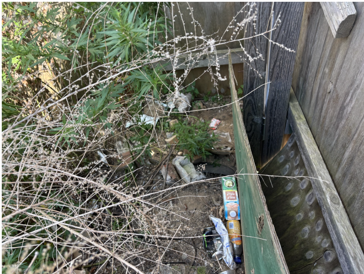
Photo 2: Sediment and debris buildup at the apparent location of MW-6 within the fenced portion of the Site boundary.