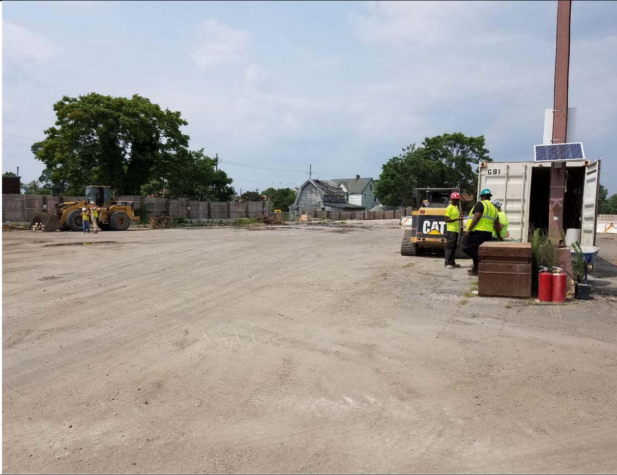
Photo 7- View looking north from Grid area C5. View is looking off- site to the north.