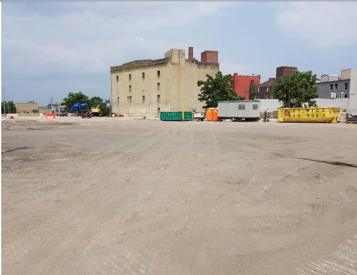
Photo 9- View of the excavation near Grids D, E, and F 4.