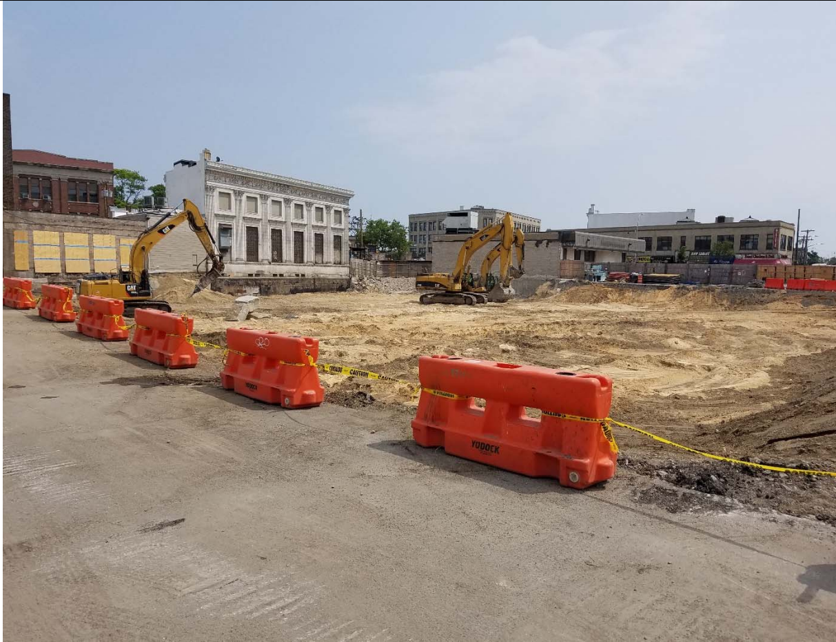
Photo 2- View of excavation near grids D2 and D3.

Photo 1 – View looking at excavation area near grids E and F 2 and 3. View is looking towards south.