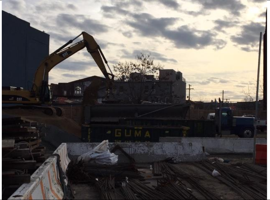
Photo 2- View of pouring concrete in A2 and B2.