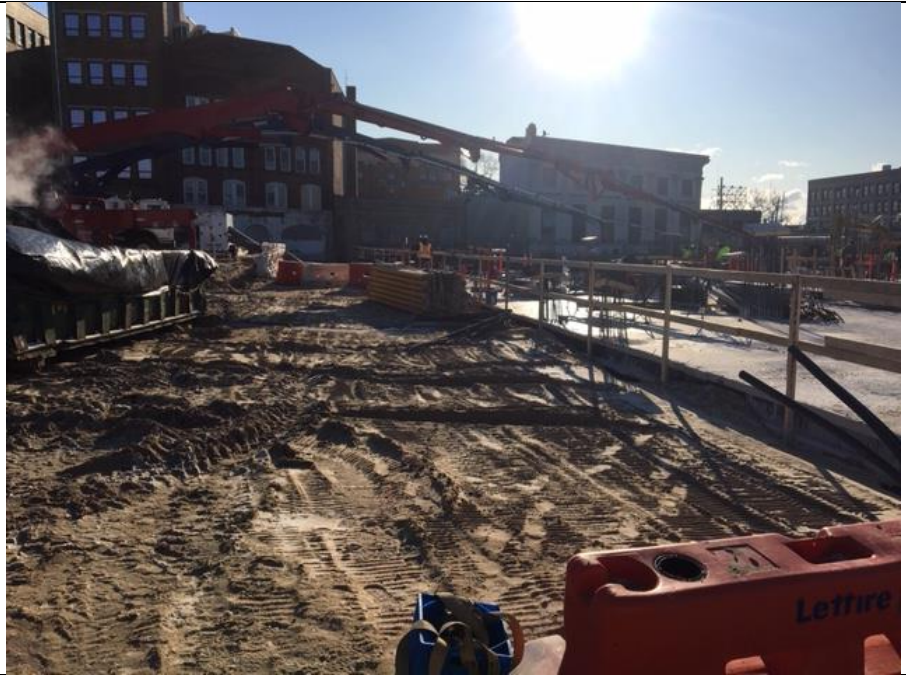
Photo 2- View of concrete being poured in E2, E3, E4, F2, F3, and F4.