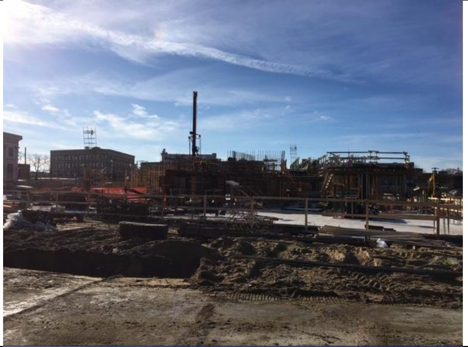
Photo 2- View of Building C.