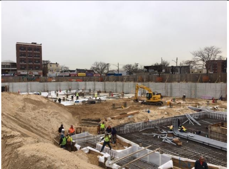
Photo 2- View of pouring concrete in D2, D3, and D4.