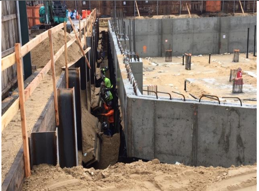
Photo 2- View of Bituthene installation in A4.