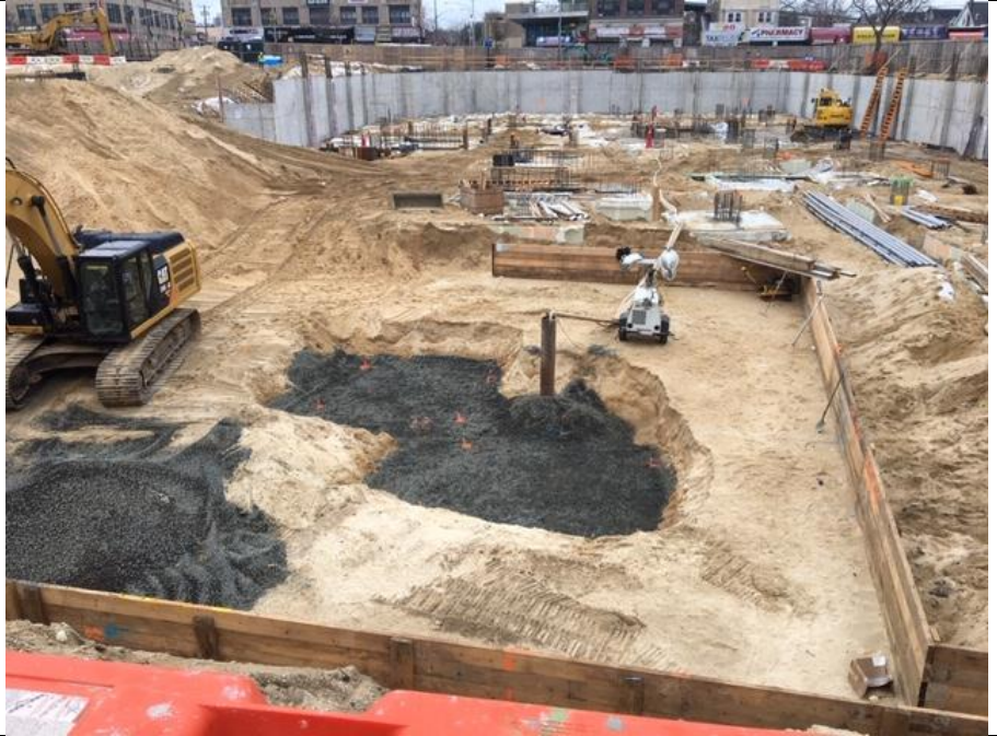
Photo 2- View of rebar installation in E2, E3, E4, F2, F4, and F4.