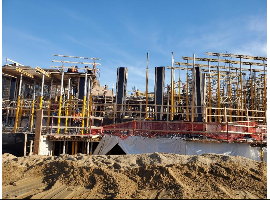
Photo 2- View of rebar installation in A1, A2, B1, and B2.