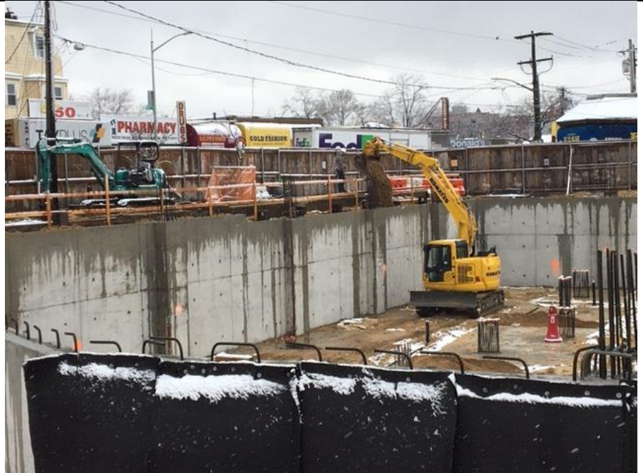
Photo 2- View of backfilling soil in A1 and B1.