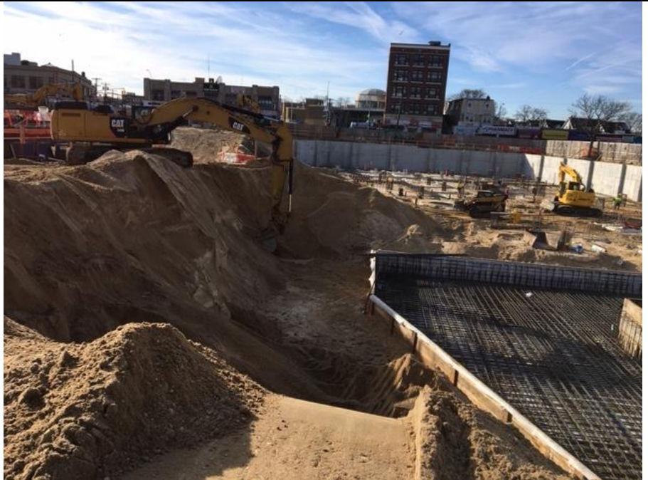
Photo 2- View of spread stone in A1, A2, B1, and B2.