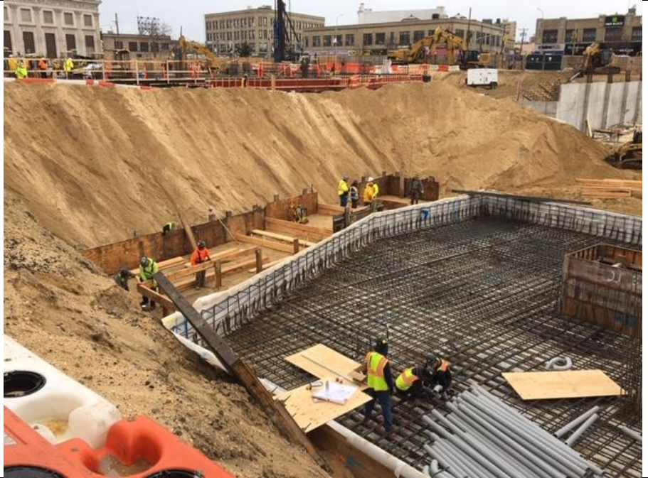
Photo 2- View of backfilling soil and installation of Bituthene and Hydroduct in A4.