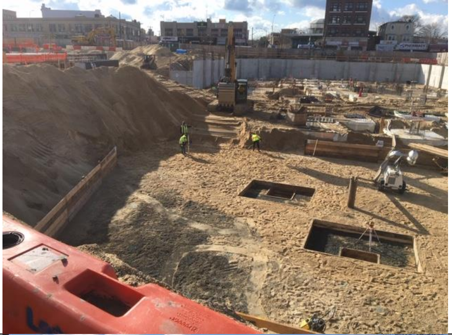
Photo 2- View of trenching and grading soil in A2 for utility installation.