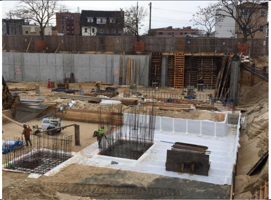
Photo 2- View of pouring concrete in E2, E3, E4, F2, F3, and F4.