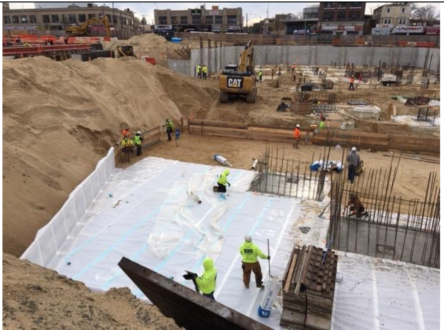
Photo 2- View of rebar installation in A3, A4, B3, and B4.