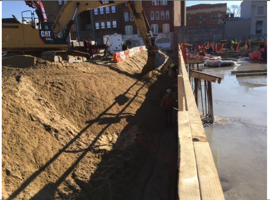
Photo 2- View of installed Preprufe 200 in B2 and B3.