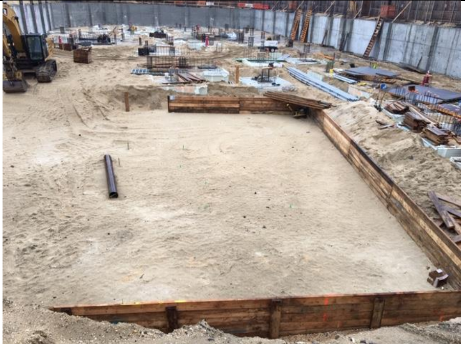
Photo 2- View of rebar installation in D2, D3, E2, and E3.