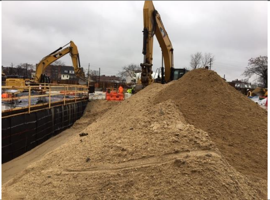
Photo 2- View of pouring concrete in B3 and B4.