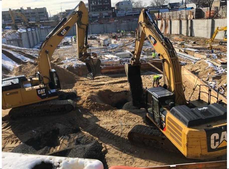
Photo 2- View of rebar installation in E2, E3, E4, F2, F4, and F4.