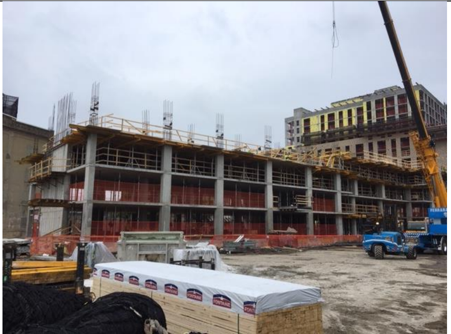
Photo 2- View of rebar, utility, and formwork installation in A1, A2, B1, and B2.