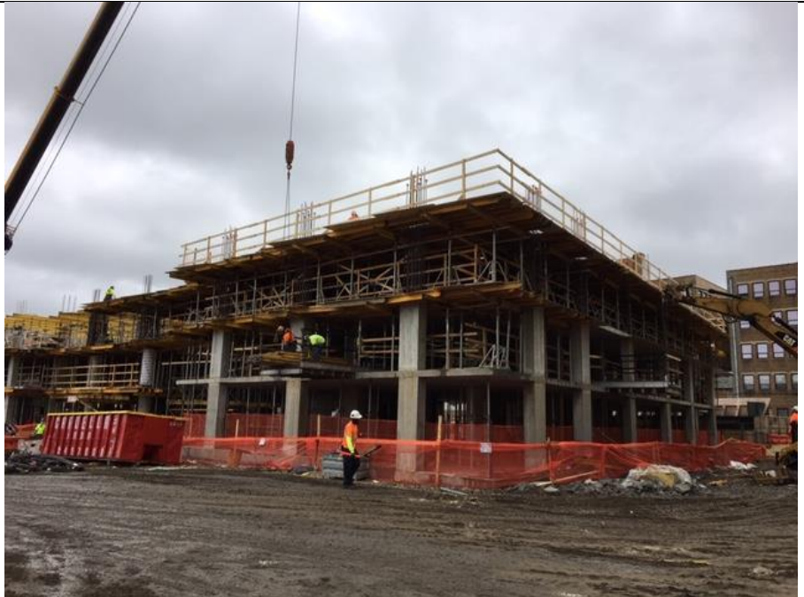
Photo 2- View of rebar, utility, and formwork installation in A3, A4, B3, and B4.