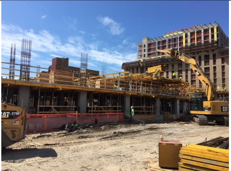
Photo 2- View of rebar, utility, and formwork installation in A3, A4, B3, and B4.