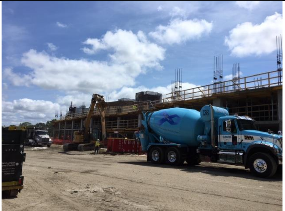
Photo 2- View of rebar, utility, and formwork installation in A3, A4, B3, and B4.

Photo 1- View of rebar, utility, and formwork installation in C6, C7, and C8.