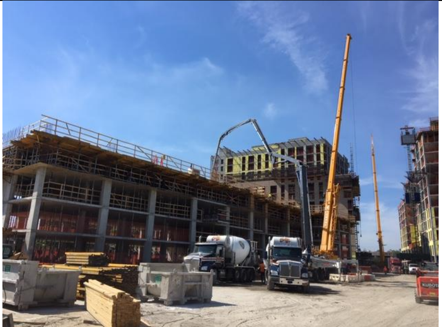
Photo 2- View of rebar, utility, and formwork installation in A3, A4, B3, and B4.

Photo 1- View of pouring concrete, rebar, utility, and formwork in C6-C8.