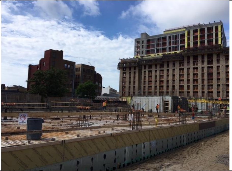
Photo 2- View of pouring concrete in D5 and D6.