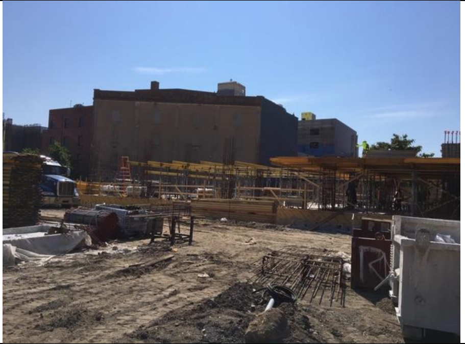
Photo 2- View of formwork, rebar, utility installation in D3, D4, E3, and E4.