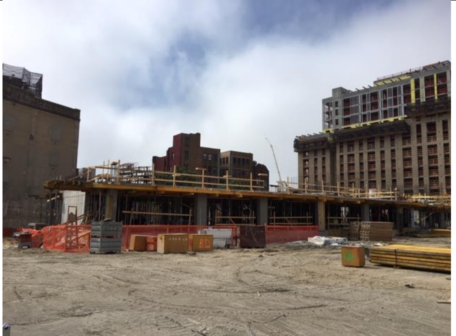
Photo 2- View of rebar, utility, and formwork installation in A3, A4, B3, and B4.