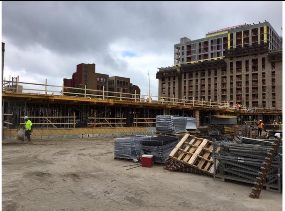
Photo 2- View of grading stone in C5 and D5.