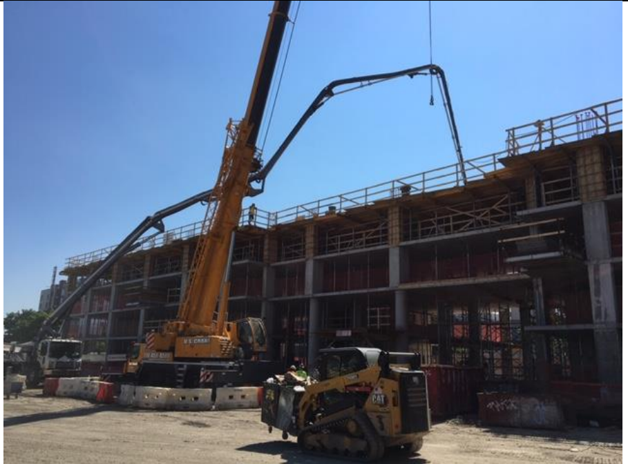
Photo 2- View of rebar, utility, and formwork installation in A3, A4, B3, and B4.