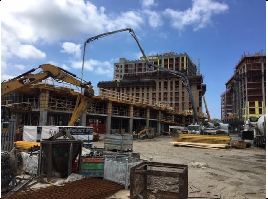
Photo 2- View of rebar, utility, and formwork installation in A3, A4, B3, and B4.