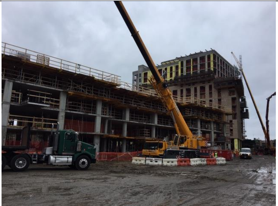
Photo 2- View of pouring concrete, rebar, utility, and formwork installation in A3, A4, B3, and B4.