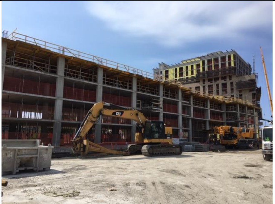
Photo 2- View of rebar, utility, and formwork installation in A3, A4, B3, and B4.

Photo 1- View of pouring concrete, rebar, utility, and formwork in C6-C8.