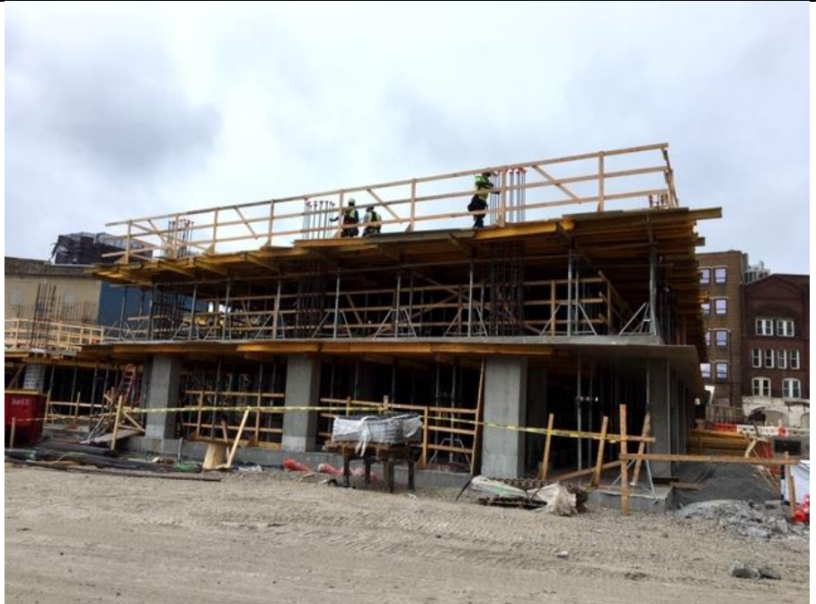
Photo 2- View of pouring concrete, rebar, utility, and formwork installation in A3, A4, B3, and B4.