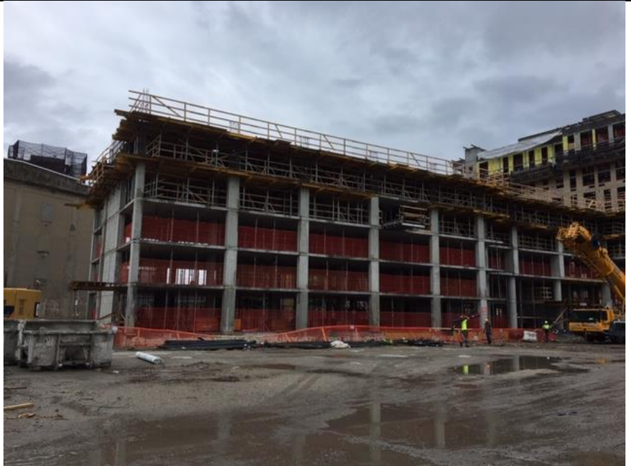
Photo 2- View of pouring concrete, rebar, utility, and formwork installation in A3, A4, B3, and B4.