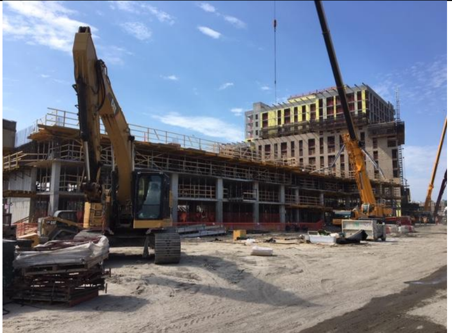
Photo 2- View of pouring concrete, rebar, utility, and formwork installation in A3, A4, B3, and B4.

Photo 1- View of rebar, utility, and formwork installation in C6, C7, and D5.