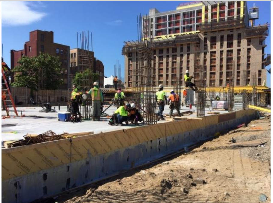
Photo 2- View of formwork, rebar, utility installation in C5 and C6.