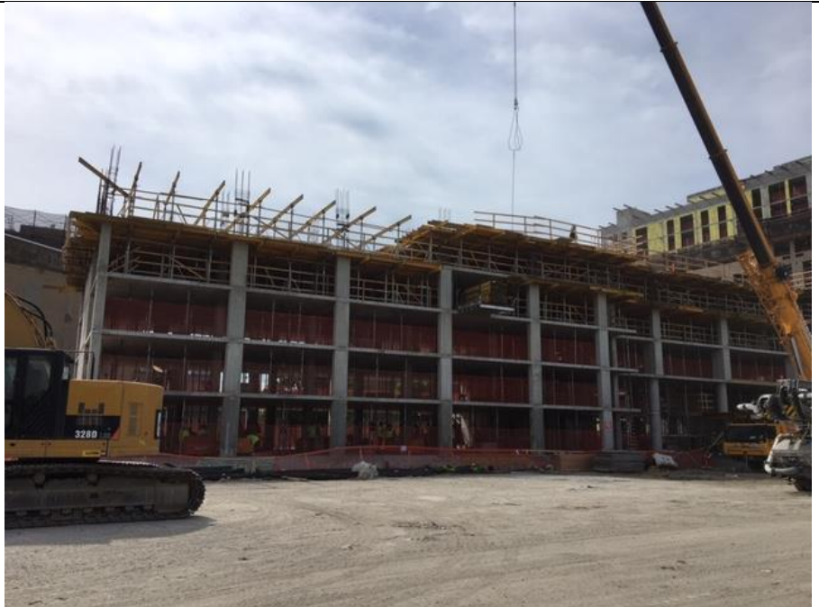
Photo 2- View of rebar, utility, and formwork installation in A3, A4, B3, and B4.