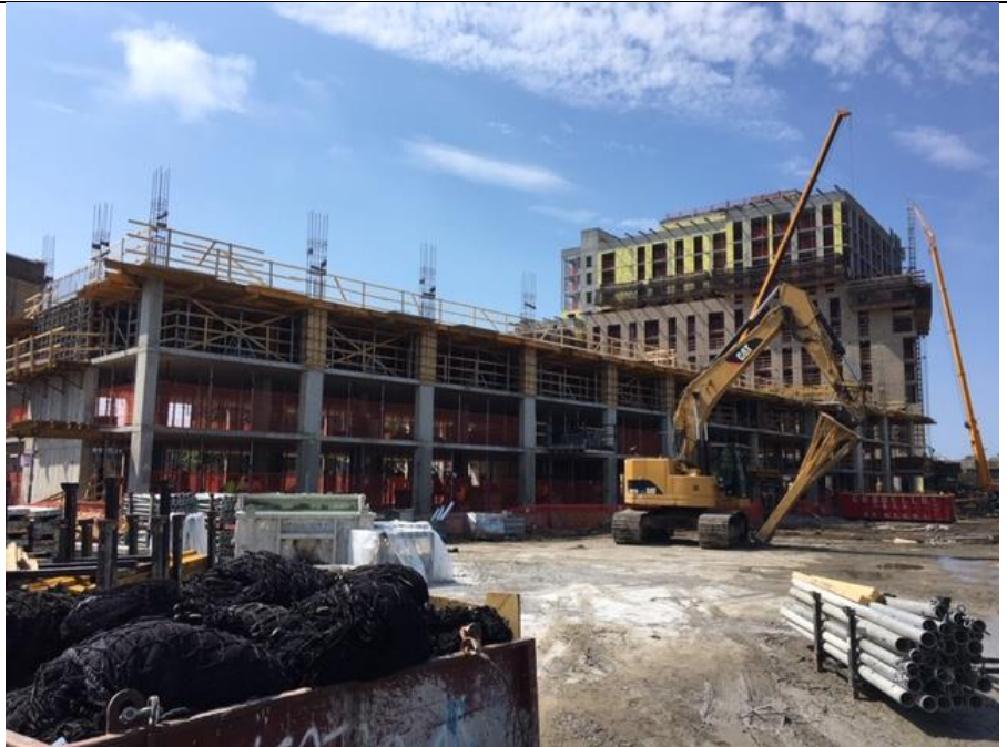
Photo 2- View of rebar, utility, and formwork installation in A3, A4, B3, and B4.