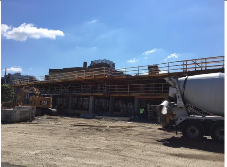
Photo 2- View of pouring concrete, rebar, utility, and formwork installation in A3, A4, B3, and B4.

Photo 1- View of rebar, utility, and formwork installation in C7 and C8.