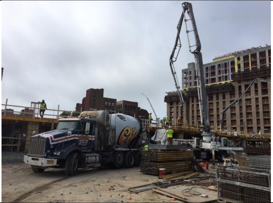
Photo 2- View of rebar, utility, and formwork installation in A3, A4, B3, and B4.