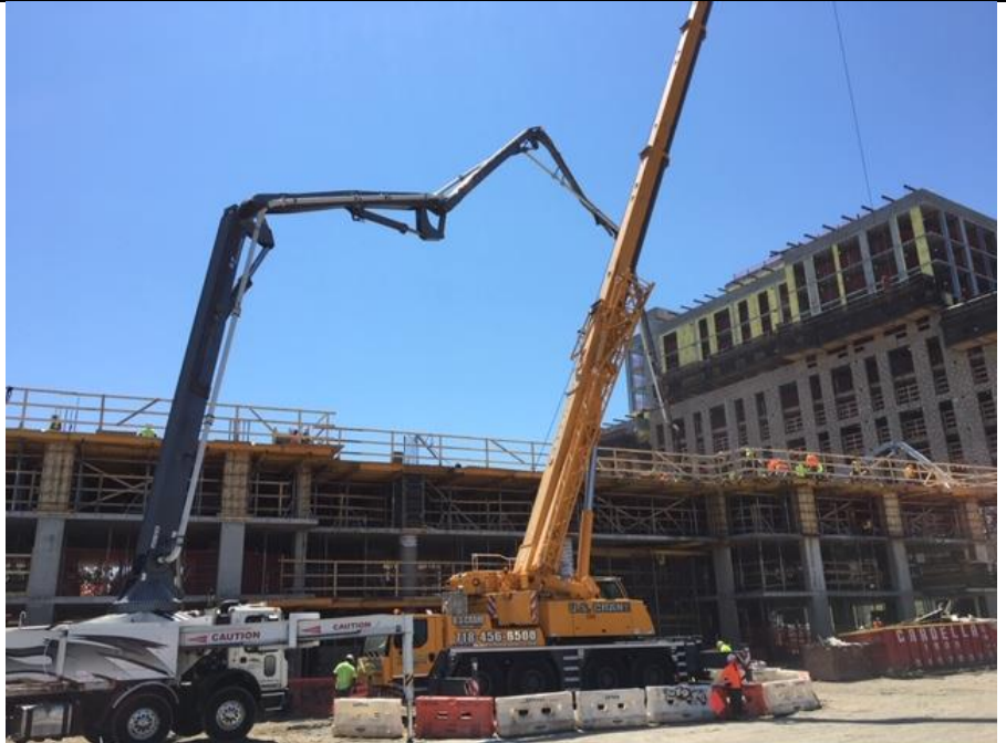
Photo 2- View of rebar, utility, and formwork installation in A3, A4, B3, and B4.

Photo 1- View of pouring concrete, rebar, utility, and formwork installation in C6, C7, and D5.