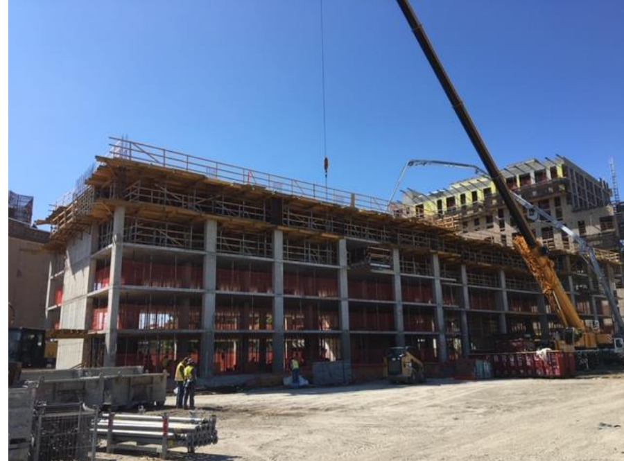
Photo 2- View of pouring concrete, rebar, utility, and formwork installation in A3, A4, B3, and B4.

Photo 1- View of pouring concrete, rebar, utility, and formwork in C6-C8.