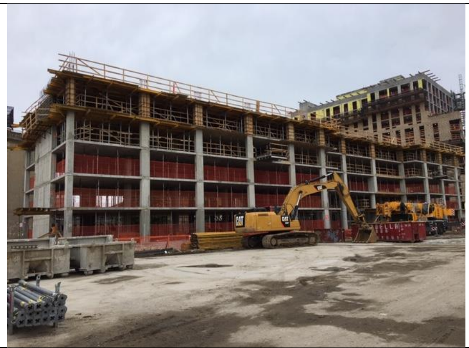
Photo 2- View of rebar, utility, and formwork installation in A3, A4, B3, and B4.

Photo 1- View of pouring concrete, rebar, utility, and formwork in C6-C8.