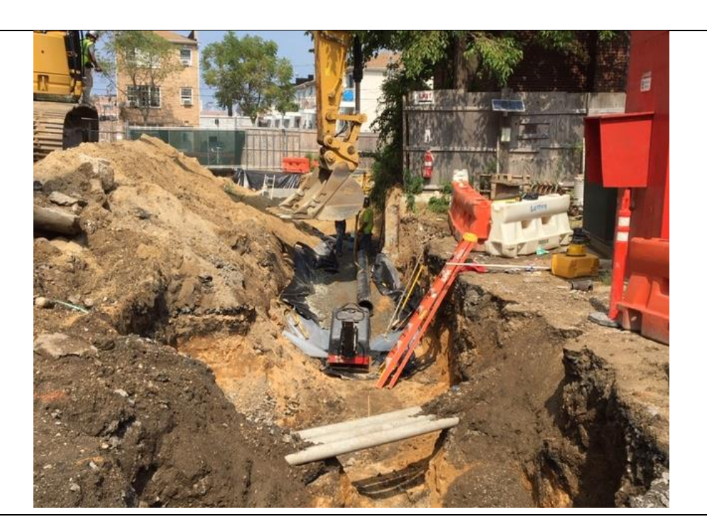
Photo 3- View of installed filter fabric and stone in A5 and B5 for utilities.