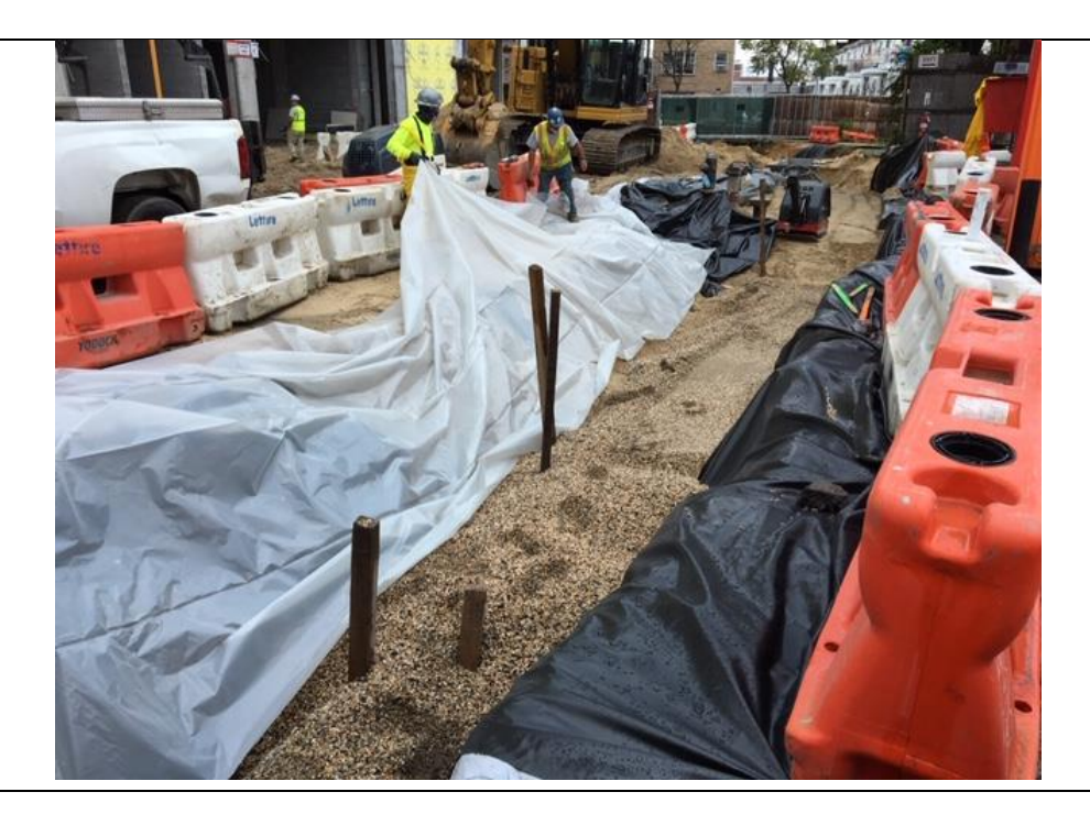
Photo 3- View of installing filter fabric and waterproofing membrane around utilities in A5 and B5.