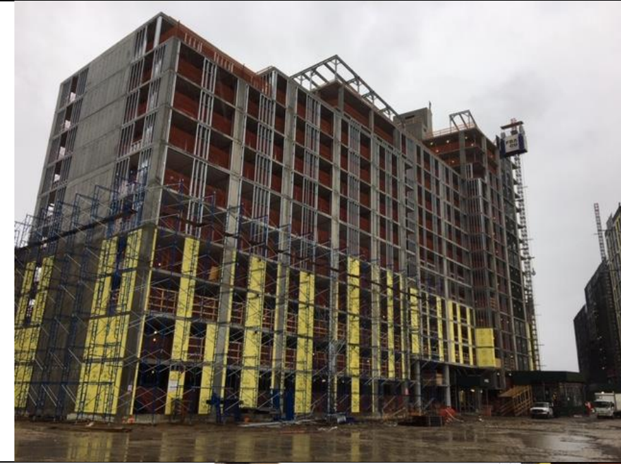
Photo 2- View of utility and formwork installation in D3, D4, E3, and E4.

Photo 1- View of utility and formwork installation in C6-C8.