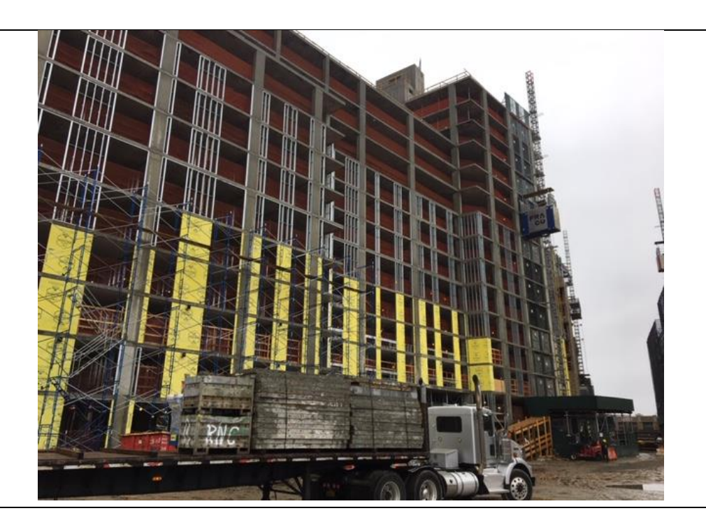
Photo 3- View of rebar, formwork, and utility installation in C6-C8.