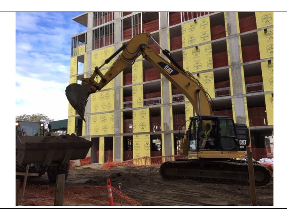
Photo 3- View of excavation of soil in D5 for utility installation.