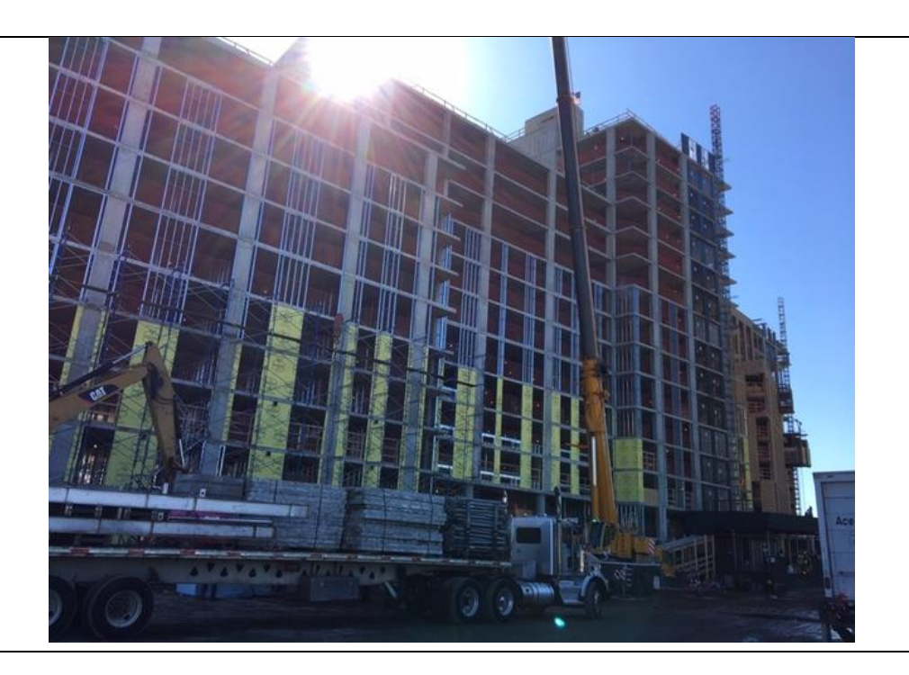
Photo 3- View of rebar, formwork, and utility installation in C6-C8.