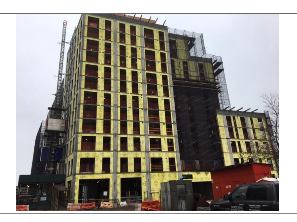
Photo 3- View of utility and formwork installation in A3, A4, B3, and B4.