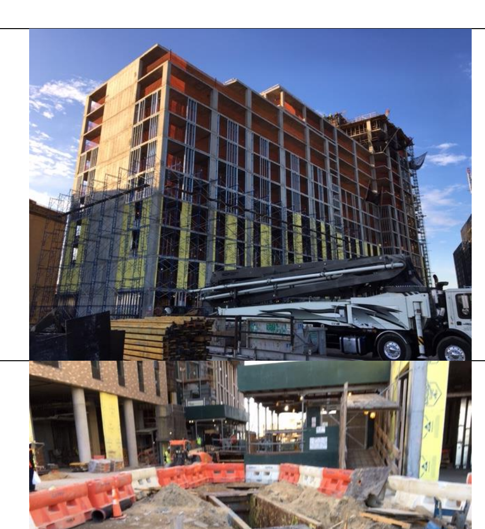
Photo 2- View of excavating soil and utility installation in B5 and C5.

Photo 1- View of rebar, formwork, and utility installation in C6-C8.