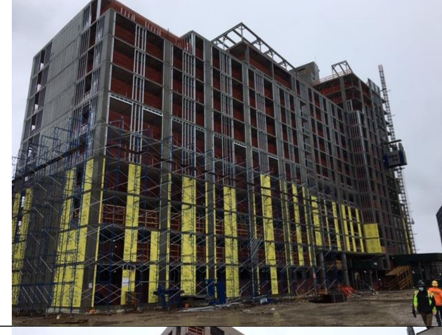
Photo 2- View of utility and formwork installation in D3, D4, E3, and E4.

Photo 1- View of utility and formwork installation in C6-C8.