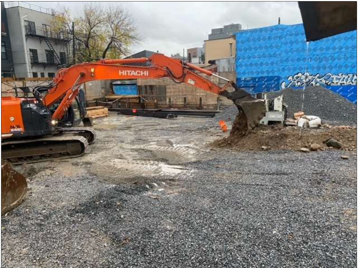
Photo 4 – A view of the area in grid B3 as its getting ready for lagging and underpinning.