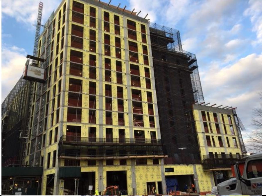
Photo 2- View of utility installation in C6-C7.

Photo 1- View of utility and formwork installation in A3, A4, B3, and B4.