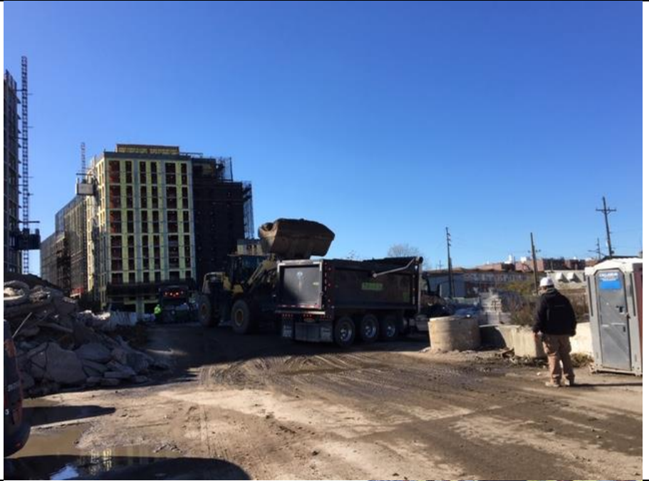
Photo 2- View of utility installation in C6-C8.

Photo 1- View of utility and formwork installation in A3, A4, B3, and B4.