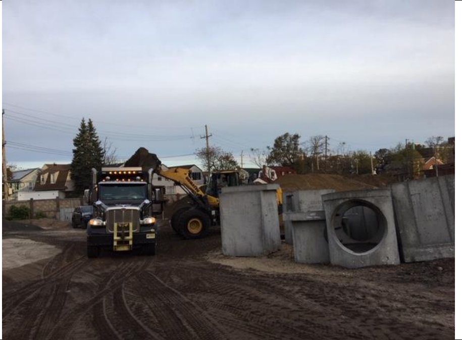
Photo 2- View of utility installation in C5 and D5.