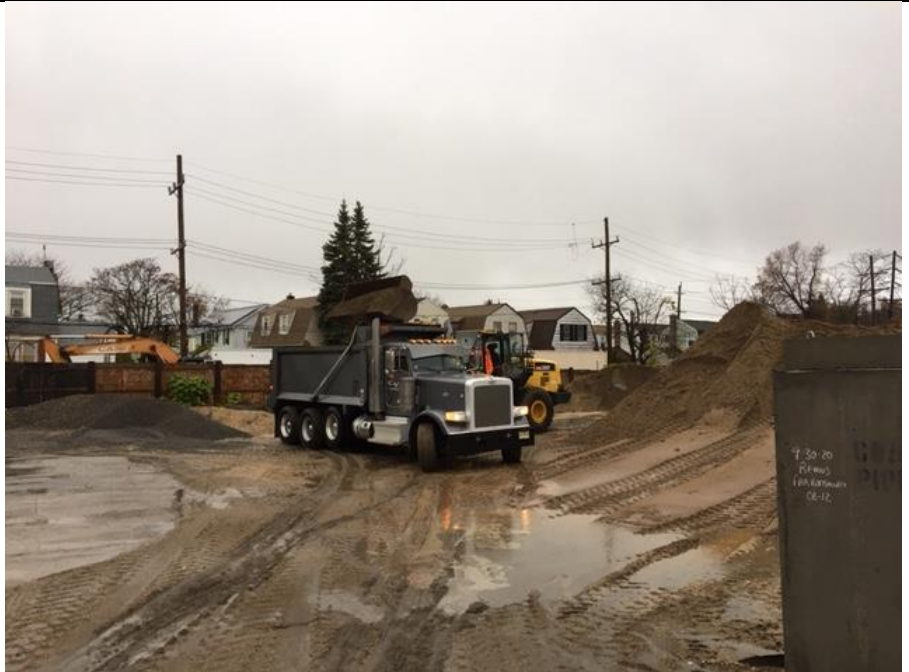
Photo 2- View of utility and formwork installation in C6-C8.