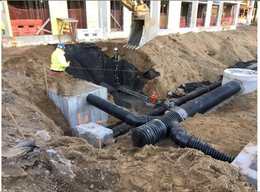
Photo 2- View of loading out soil for export offsite.