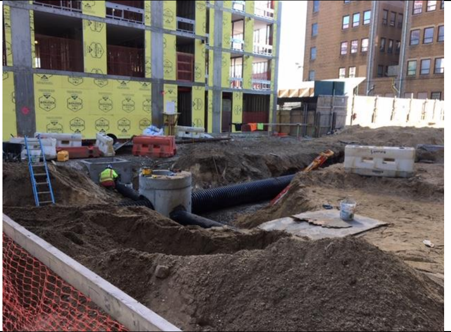
Photo 2- View of utility installation in C5 and D5.