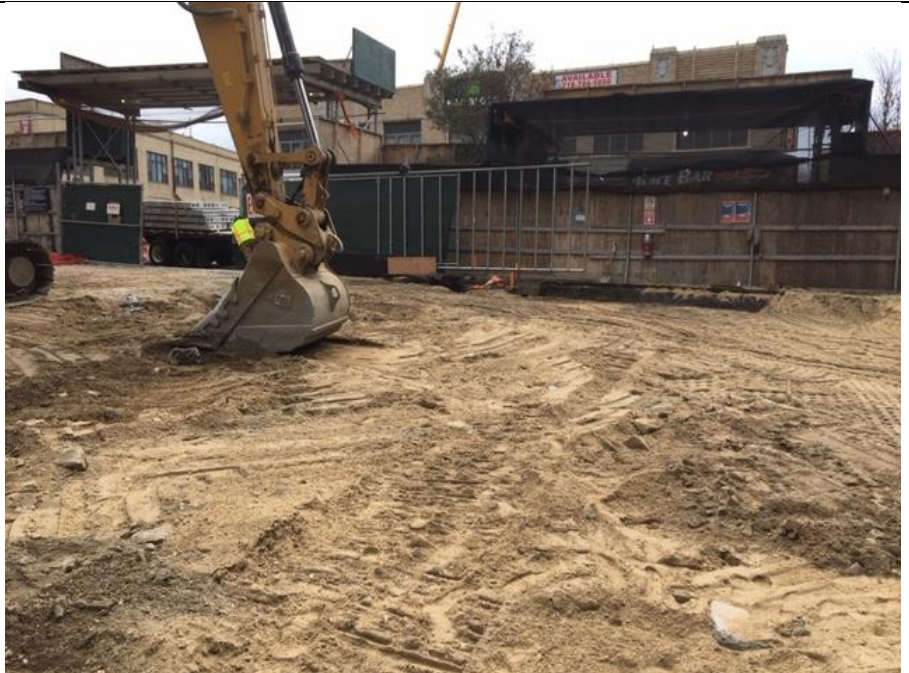
Photo 2- View of backfilled area in B1.