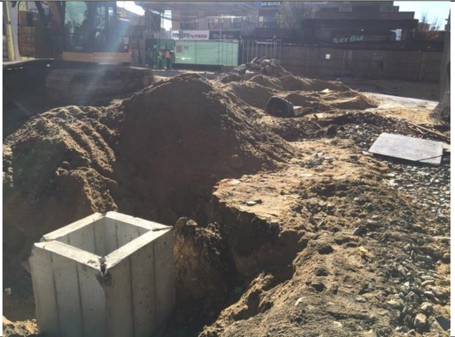
Photo 2- View of loading trucks with soil for export.