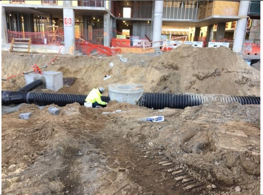
Photo 2- View of utility and formwork installation in D4, D5, E4, and E5.