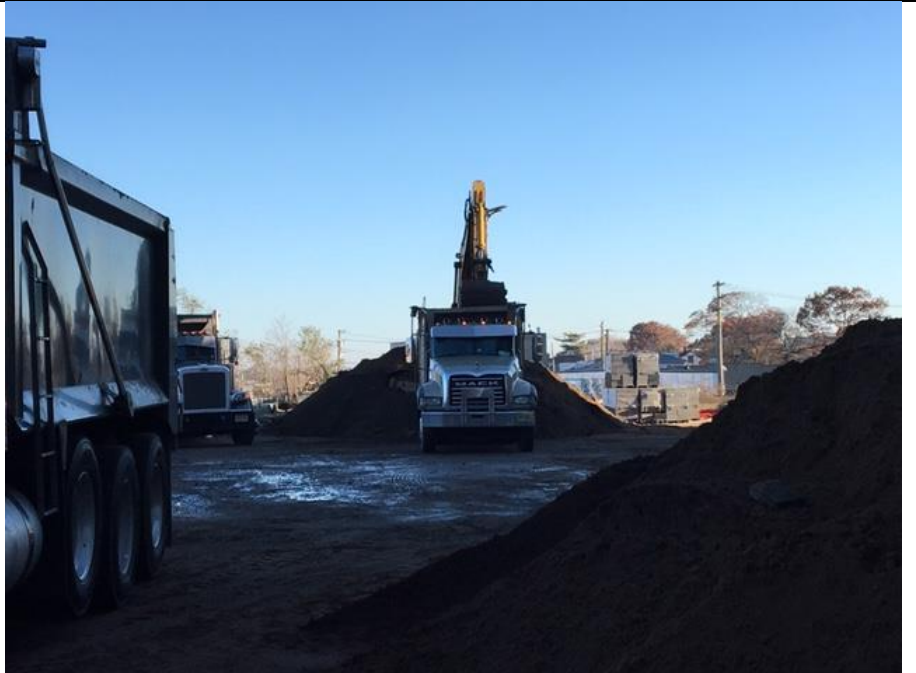
Photo 2- View of backfilling and compacting clean fill in C5 and D5.

Photo 1- View of loading out of soil for export offsite.