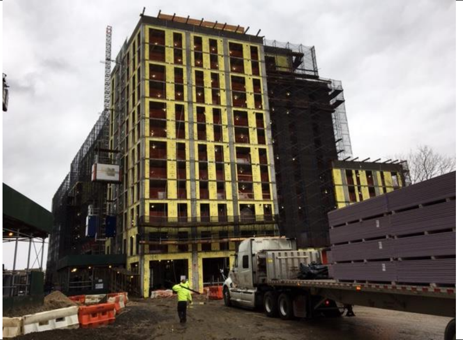
Photo 2- View of utility installation in C6-C8.

Photo 1- View of utility and formwork installation in A3, A4, B3, and B4.