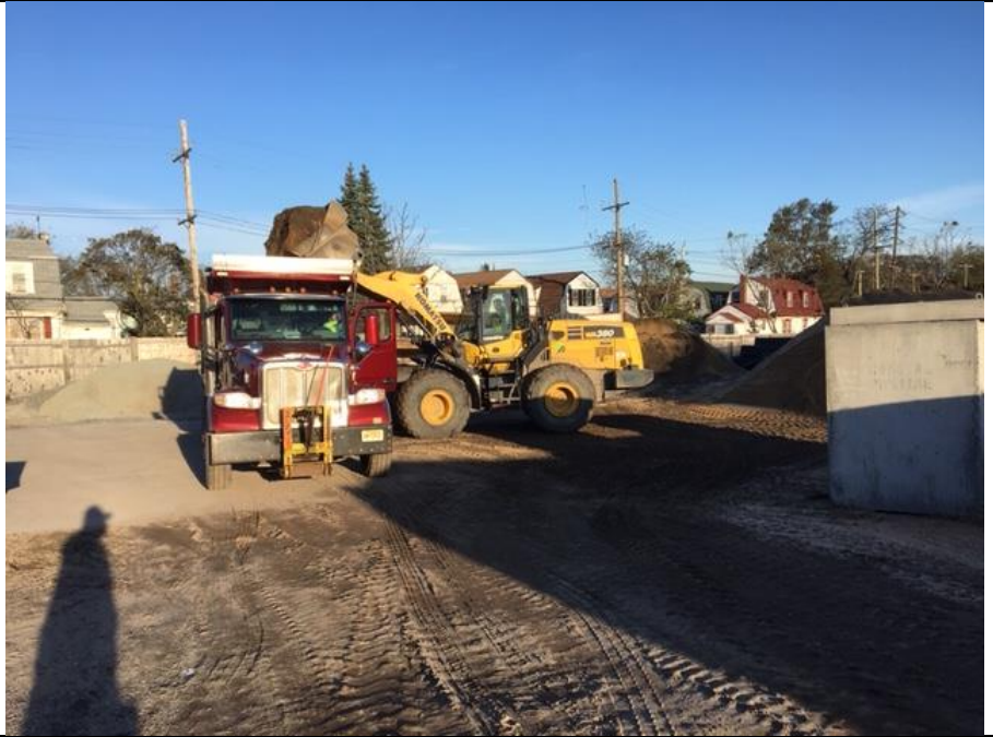
Photo 2- View of utility installation in C5 and D5.