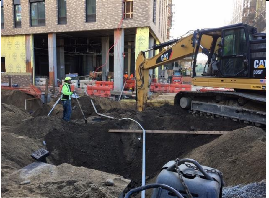
Photo 2- View of utility installation in C5 and D5.