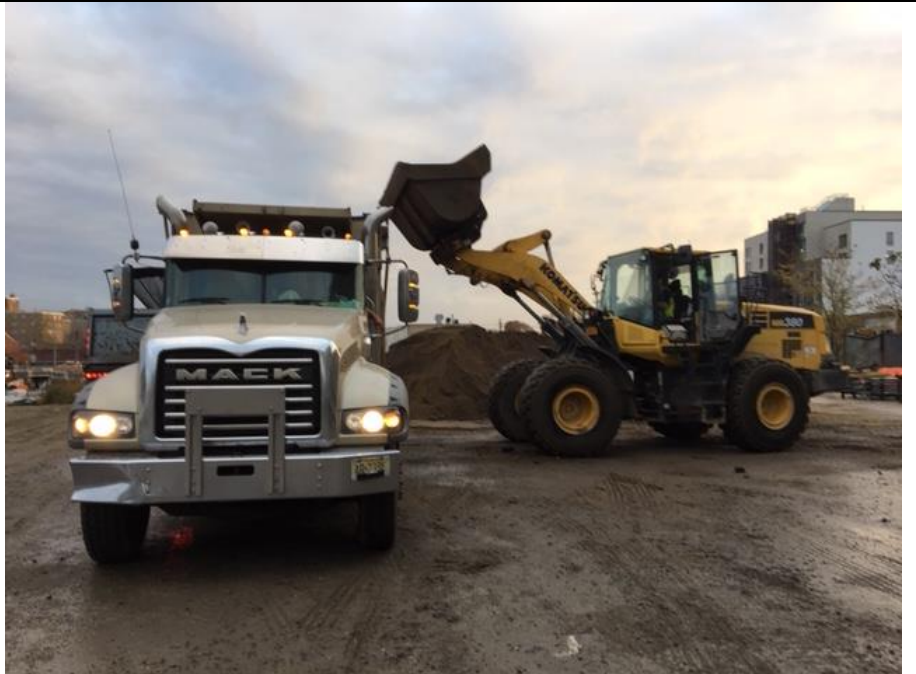
Photo 2- View of backfilled and compacted clean fill in C5 and D5.

Photo 1- View of loading out of soil for export offsite.