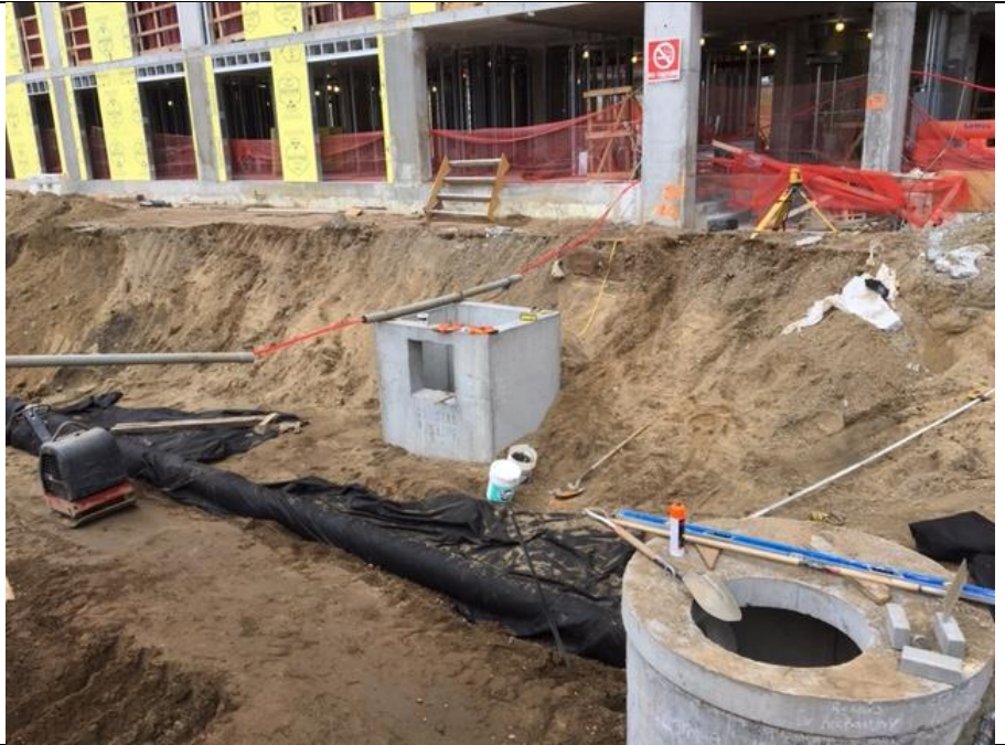
Photo 2- View of utility installation in C6-C7.