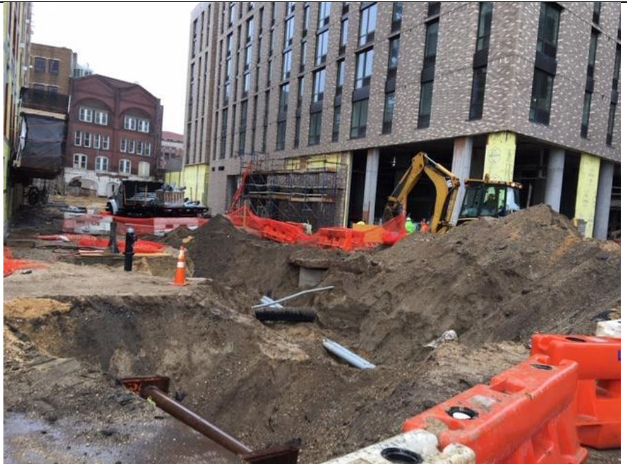
Photo 2- View of utility and formwork installation in C6-C8.