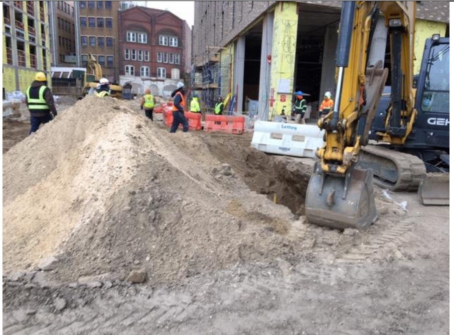
Photo 2- View of excavated clean fill and utility installation in B4 and B5.