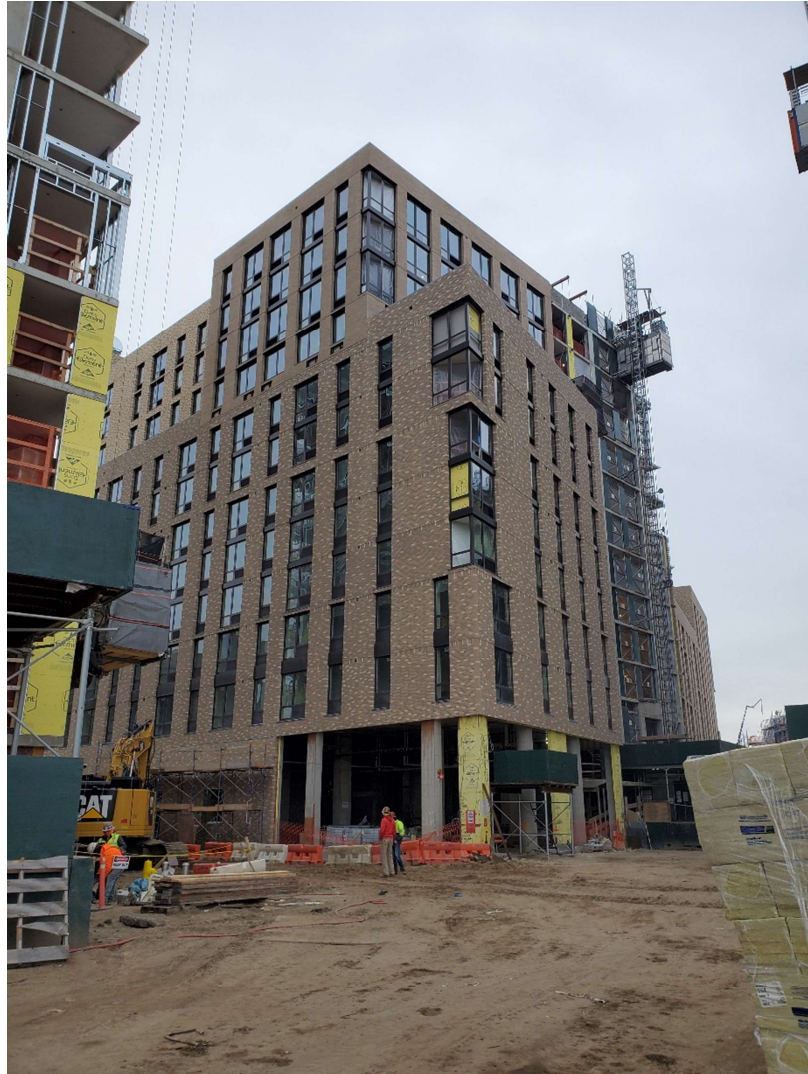
Photo 1- View of Building B grids C3, C4, and D4.