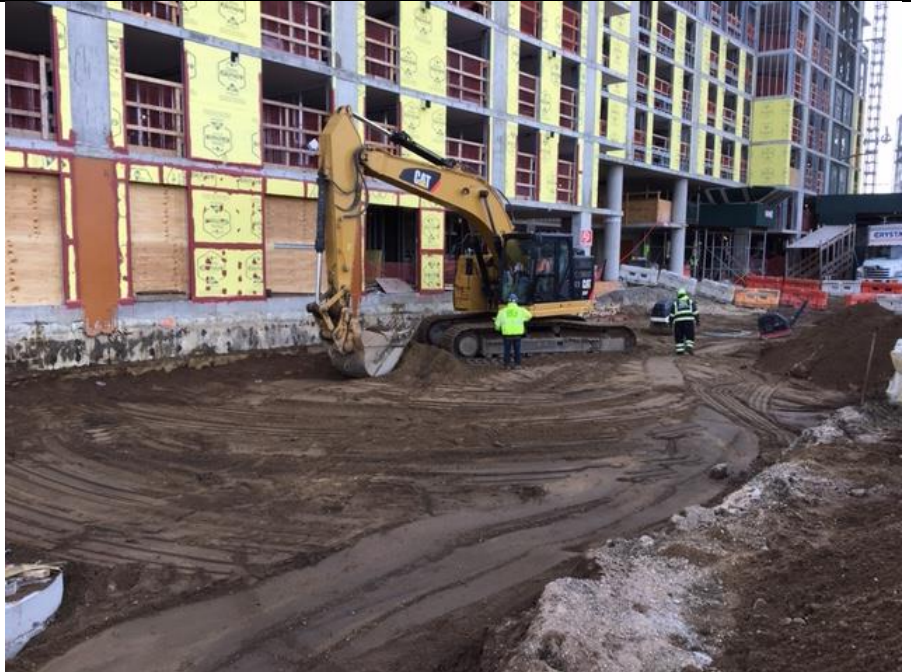
Photo 2- View of breaking up and stockpiling concrete in D5.