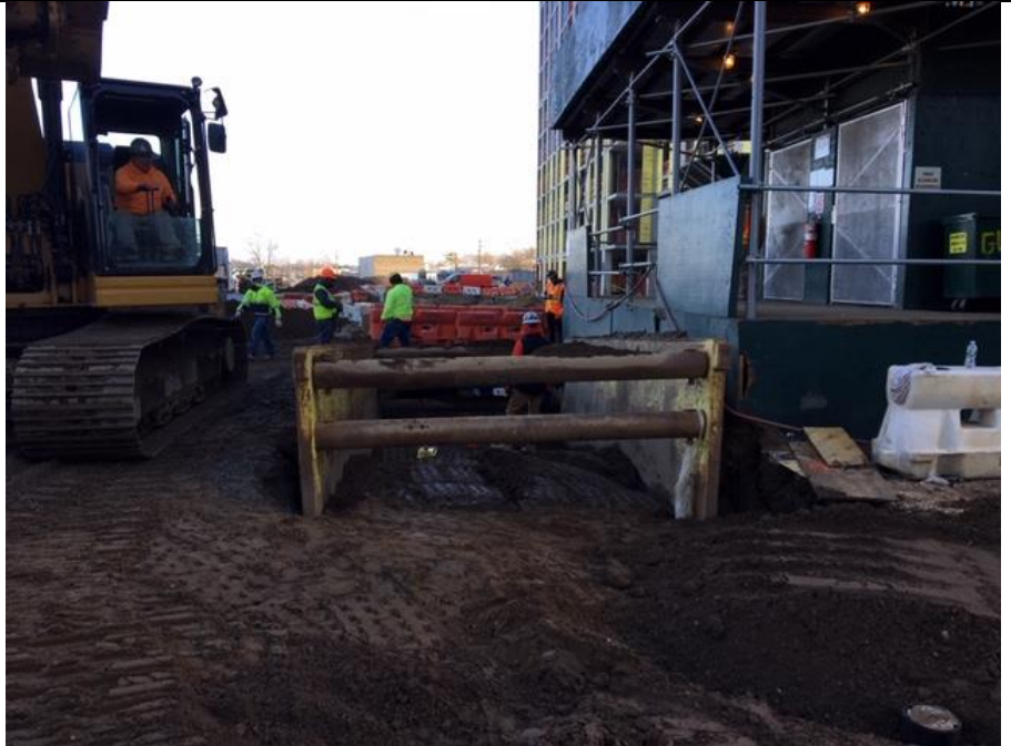
Photo 2- View of backfilling and compacting clean fill in B5 and C5.