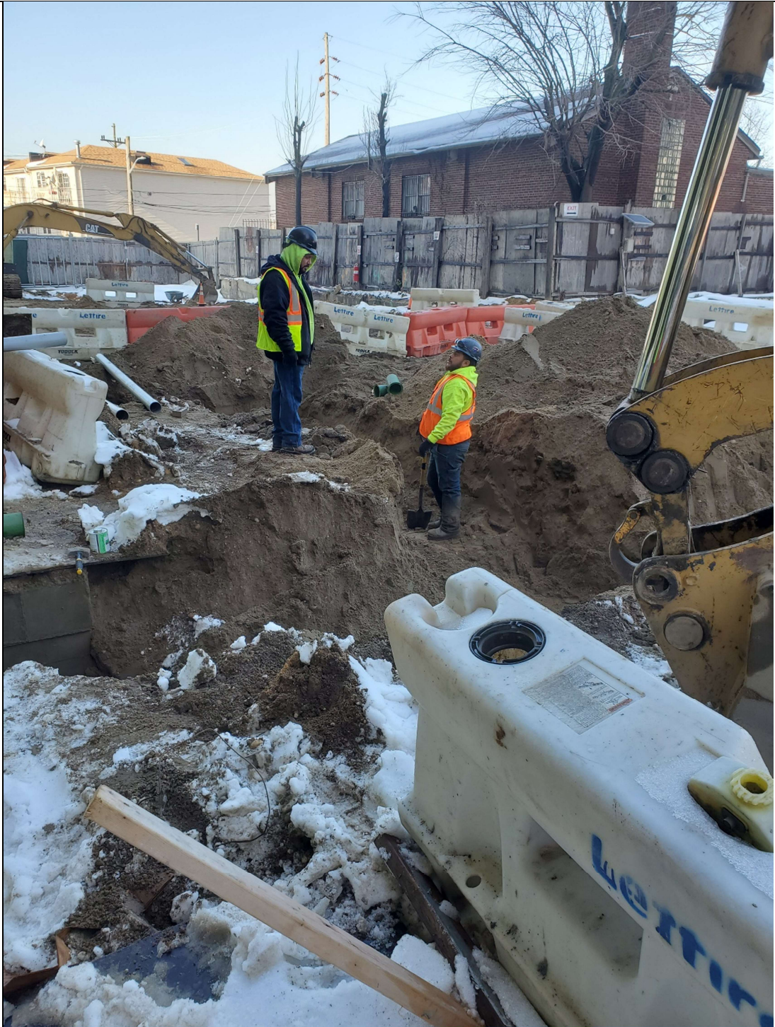
Photo 1- View of clean fill excavati on and utilities installati on A5 and B5.