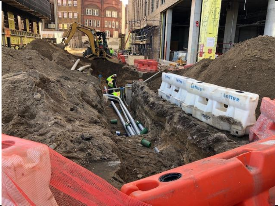
Photo 2- View of utility installation in B1 and B2.