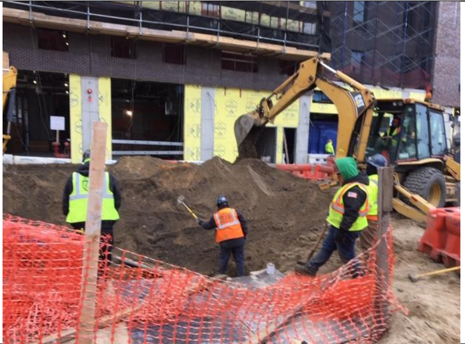
Photo 2- View of utility installation in B5 and C5.