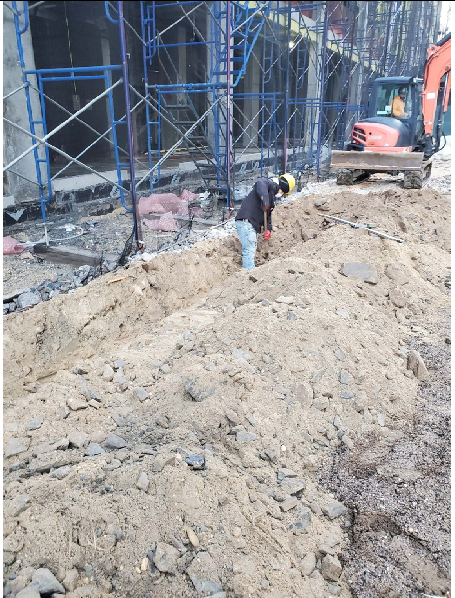
Photo 1- View of clean fill excavation and utilities installation in B1 and B4.