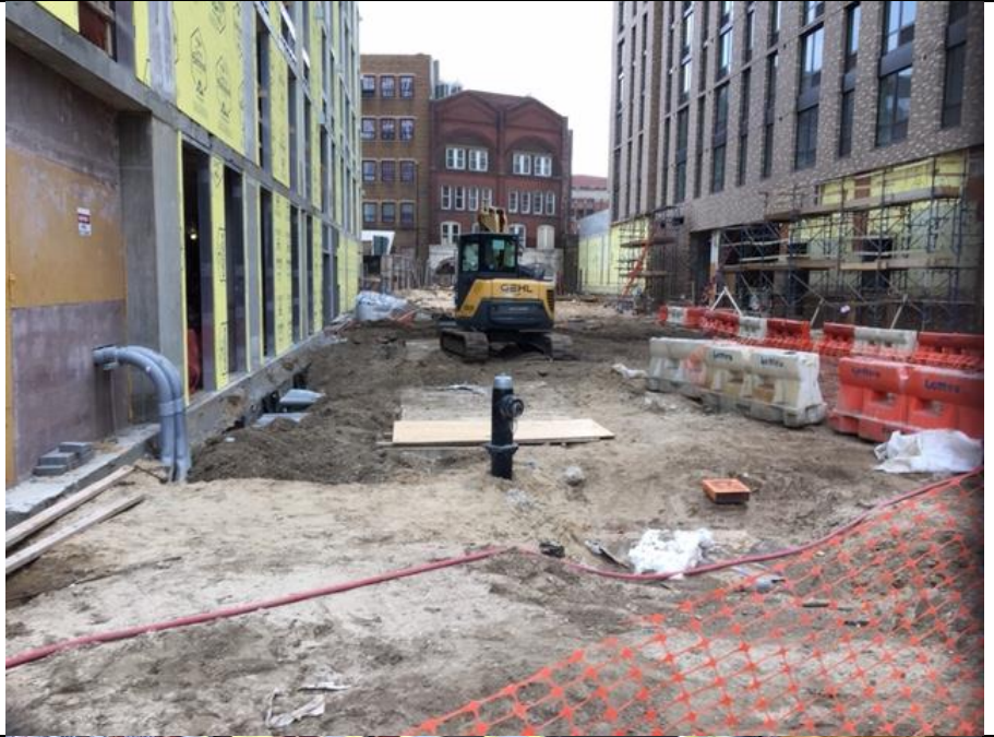
Photo 2- View of backfilling and compacting clean fill in B5 and C5.