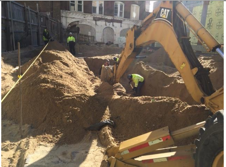
Photo 2- View of excavating clean fill in C5 for utility installation.