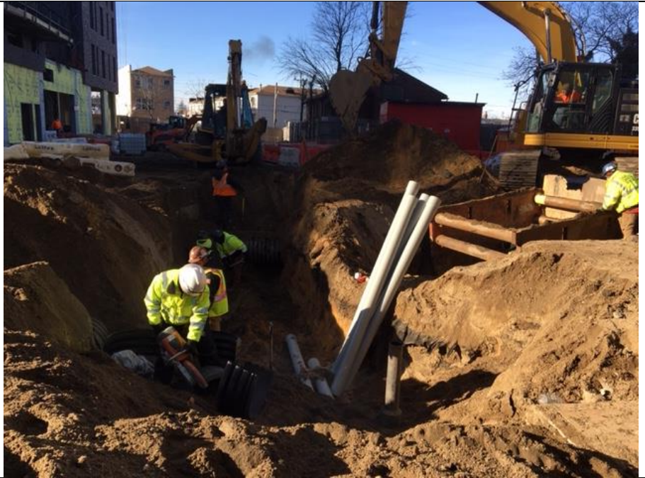
Photo 2- View of utility installation in C5 and D5.