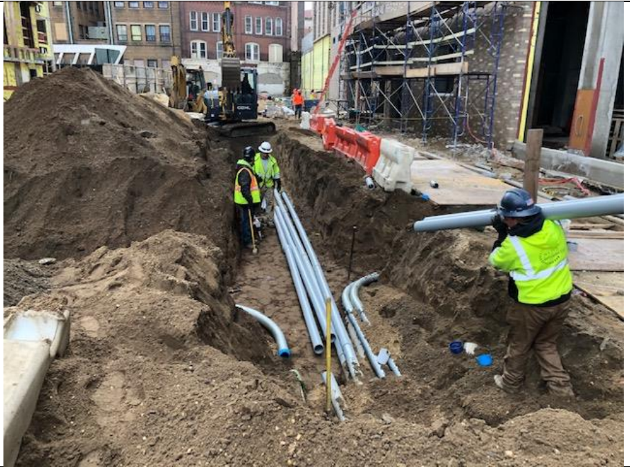
Photo 2- View of formwork and utility installation in A3, A4, B3, and B4.