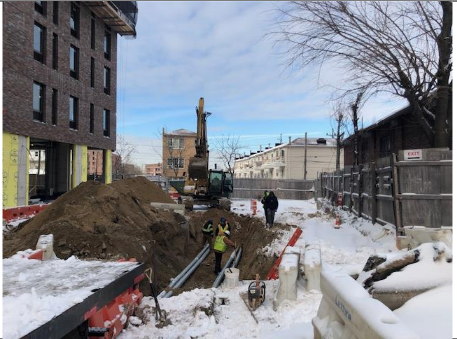
Photo 2- View of utility and formwork installation in A3, A4, B3, and B4.