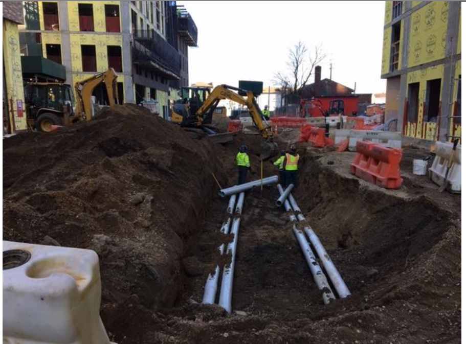
Photo 2- View of backfilling clean fill in C5 for utility installation.