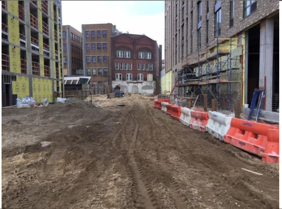
Photo 2- View of utility and formwork installation in D4, D5, E4, and E5.