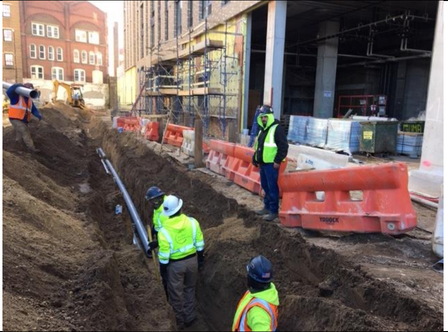
Photo 2- View of excavating clean fill and utility installation in D4 and E4.