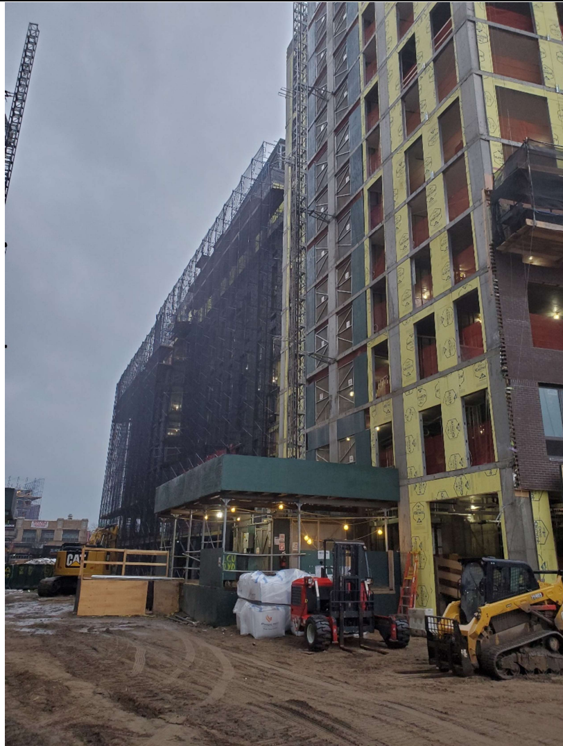
Photo 1- View of Building C grids B1, B2, B3, and B4.