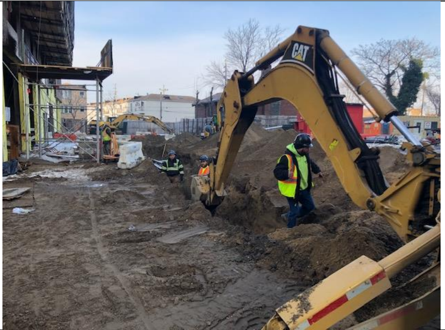
Photo 2- View of utility installation in B5.