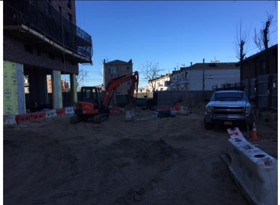
Photo 2- View of utility and formwork installation in A3, A4, B3, and B4.

Photo 1- View of excavating clean fill in A5.