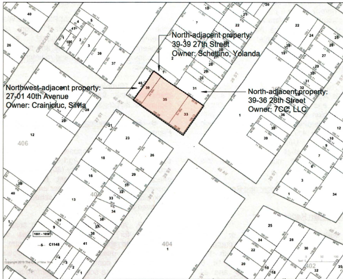
EXHIBIT A SITE MAP