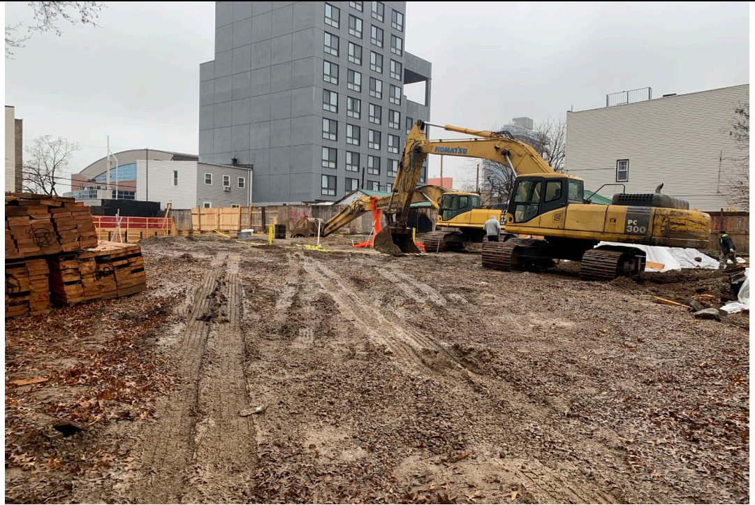
Photo 2 – View of first truck being loaded with hazardous waste from Quadrant 5