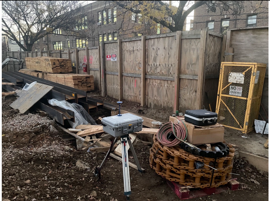
Photo 2 – View of the upwind CAMP unit on the western site boundary