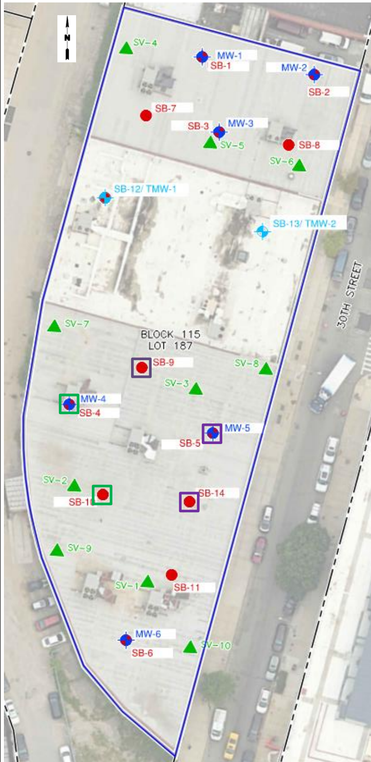
Figure 1: Sampling Location Plan