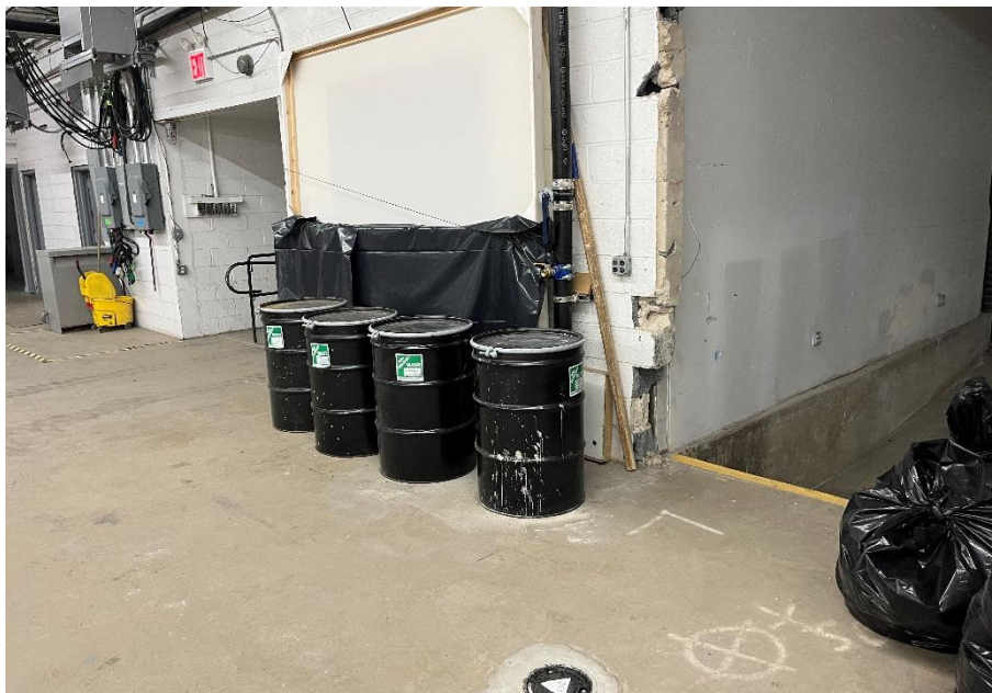
Photo 2: Soil cuttings and purge water stored in 55-gallon USDOT drums labeled 'Non-Hazardous' near the access door along 30 th Street..

Cc: M. Burke, R. Kovacs, J. Armstrong (Langan)