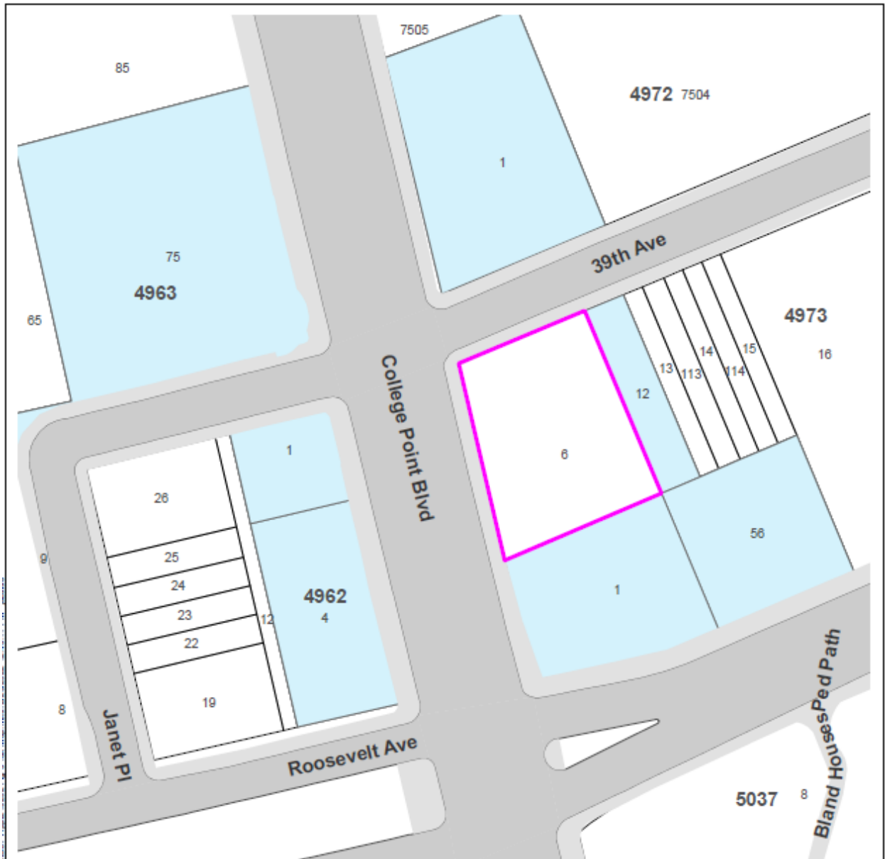
EXHIBIT A SITE MAP