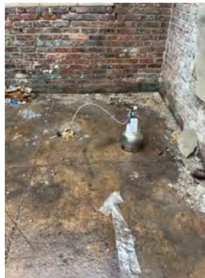
Typical soil vapor sample