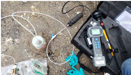
Typical tracer gas test during soil vapor sampling

Representative photographs from the reporting period are shown below.