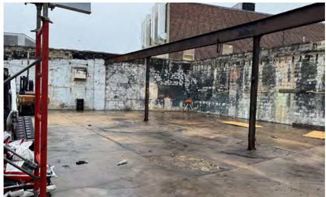
4. Typical CAMP set up, grid G4 (March 20)