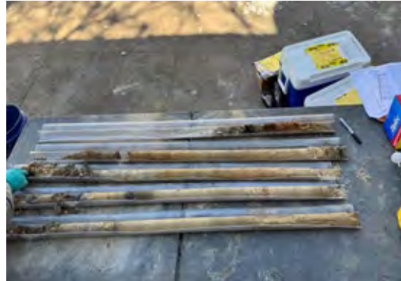
2. Typical soil boring sleeves (March 19)