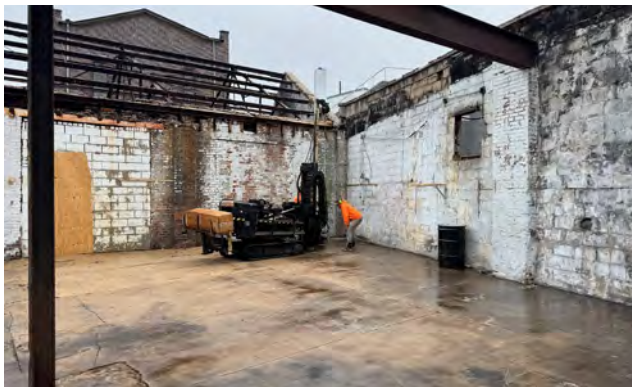
3. Geoprobe extending soil boring in grid G4 (March 20)