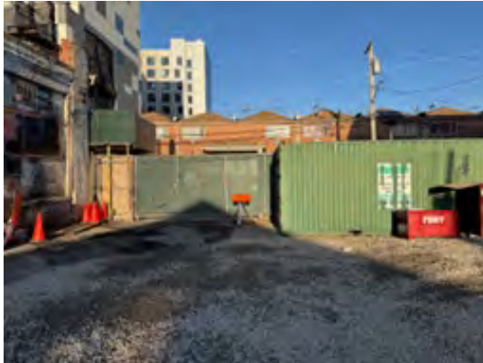
1. Typical CAMP setup, grid A2 (March 19)