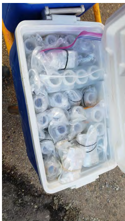
5. PFAS sample cooler (March 21)