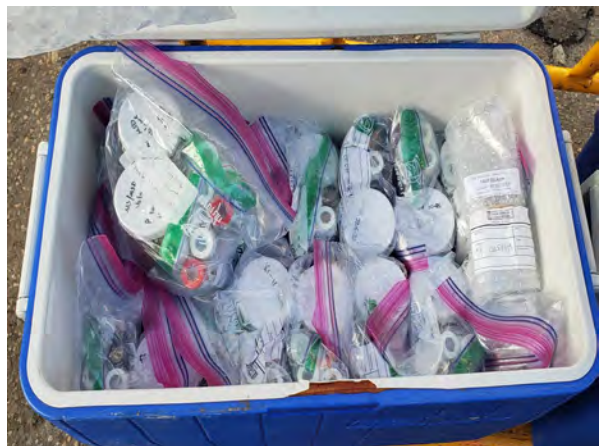
6. Soil sample cooler (March 21)