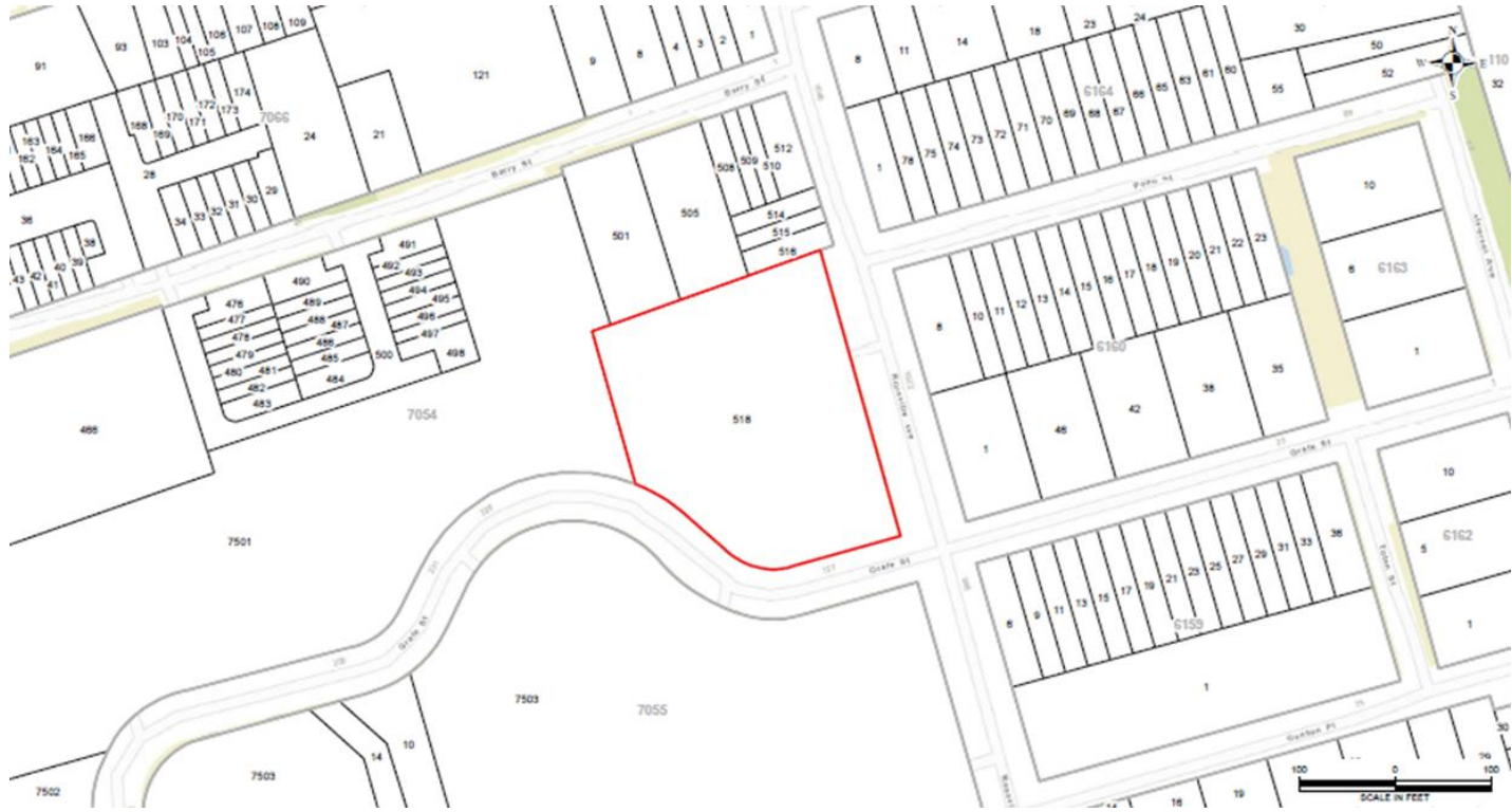
EXHIBIT A SITE MAP