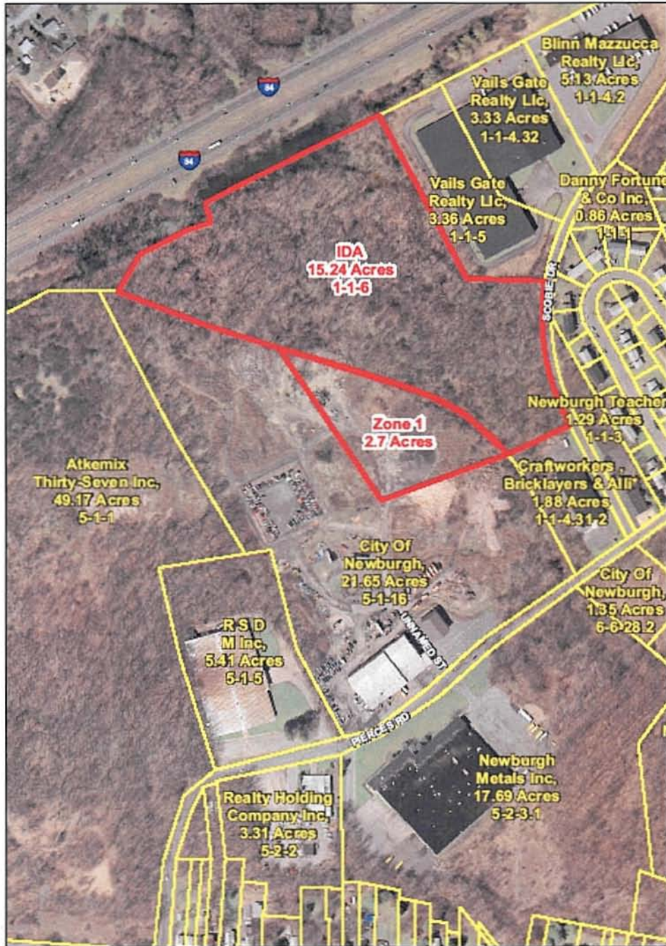
Figure 2: Aerial Image & Tax Map

Prepared by City of Newburgh Planning Department 3/27/12 Scale = 1 inch = 200 Feet