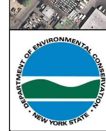
Figure 1: Site Location Map Former M. Argueso and Company, Inc.

Site No. C360108 Town of Mamaroneck, Westchester County, NY