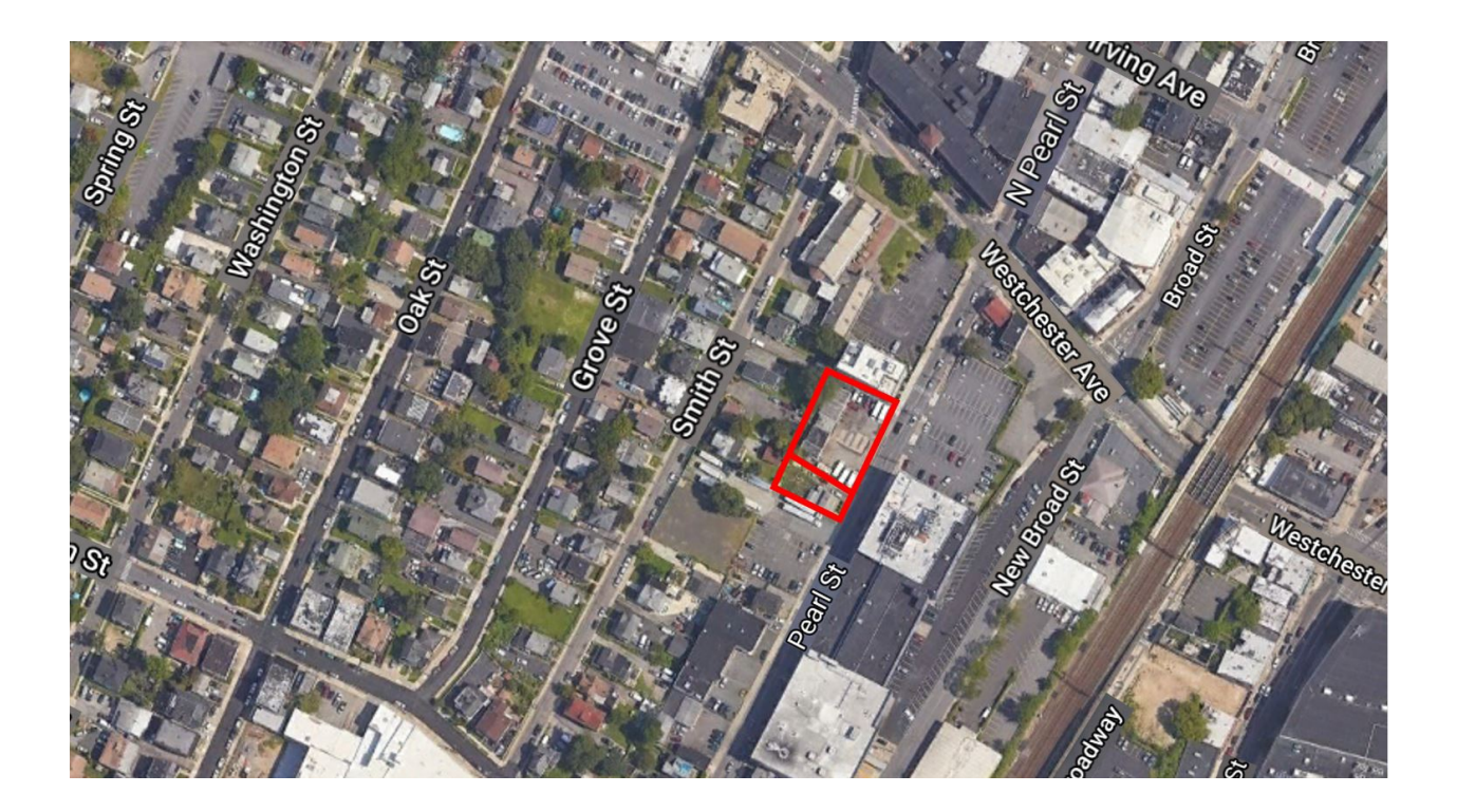
Appendix C - Site Location Map